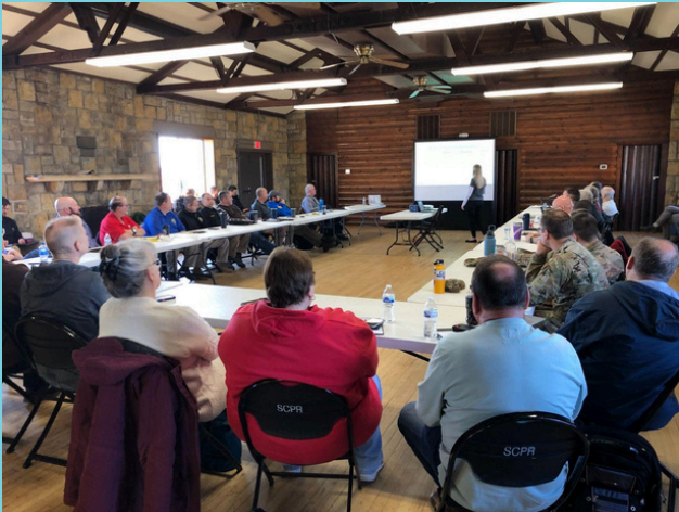
IWT MEETING IN FEBRUARY OF 2023

At NWS Topeka, we strive to constantly connect with and support our partners, including emergency management agencies, law enforcement, media, and DOTs. We also work very hard to connect with the people in the communities we serve. Work accomplished in 2023 was no exception to this. Last February, NWS Topeka hosted an Integrated Warning Team (IWT) meeting, open to all partners in northeast Kansas. The purpose of the IWT meeting is to gather NWS employees together with various partners from across the area to discuss any upcoming new or modified NWS services, discuss event successes, and find areas for improvement regarding the partnership we have in keeping the public safe and informed. The meeting was a success with over 60 attendees present.