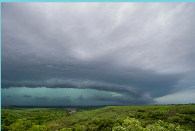
STORM MOVING OVER THE FLINT HILLS SOUTH OF MANHATTAN ON MAY 9.