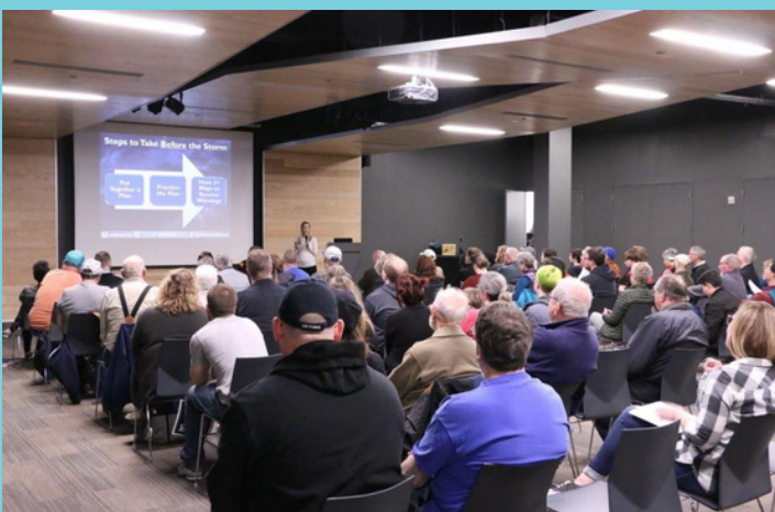
SPOTTER SHOW IN DOUGLAS COUNTY

At NWS Topeka, we strive to constantly connect with and support our partners, including emergency management agencies, law enforcement, media, and DOTs. We also work very hard to connect with the people in the communities we serve. Work accomplished in 2023 was no exception to this. Last February, NWS Topeka hosted an Integrated Warning Team (IWT) meeting, open to all partners in northeast Kansas. The purpose of the IWT meeting is to gather NWS employees together with various partners from across the area to discuss any upcoming new or modified NWS services, discuss event successes, and find areas for improvement regarding the partnership we have in keeping the public safe and informed. The meeting was a success with over 60 attendees present.