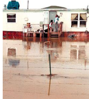
(Fremont County Flooding)

Want more information? Check out this video! Water's Fury