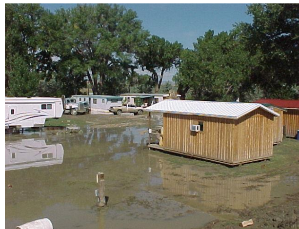
Powder River Flooding