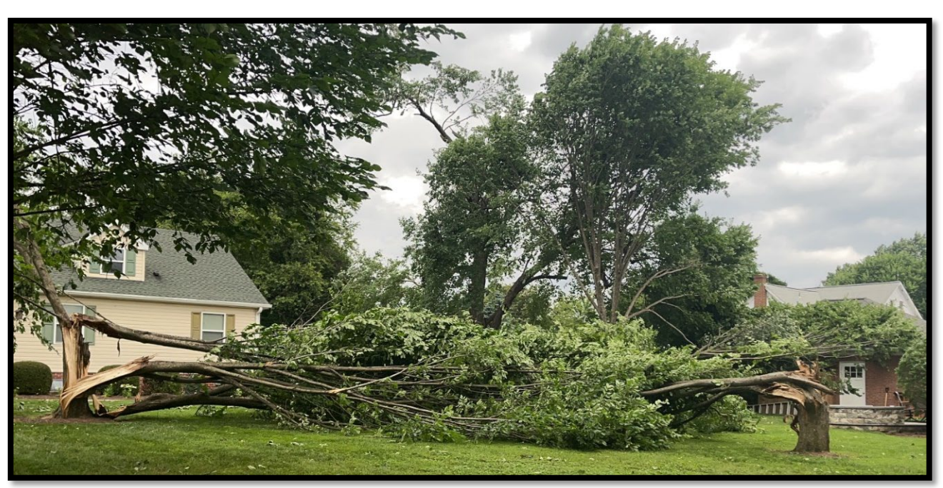
Tornado damage in Gaithersburg, MD on June 5<sup>th</sup>. Notice the trees were blown in different directions due to the rotating winds of the tornado. Overall, there were 13 tornadoes across the panhandle of WV, northern VA and central and eastern MD that touched down on June 5<sup>th</sup>. Here is a <u>summary of the event</u> from the NWS Baltimore/Washington office.