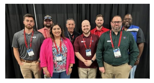
WFO Corpus Christi and Brownsville meteorologists at the Coastal Bend Hurricane Conference

As the 2024 Atlantic Tropical Season nears, WFOs Corpus Christi and Brownsville/Rio Grande Valley participated in the 13th annual Coastal Bend Hurricane Conference hosted by the Coastal Bend Emergency Management Association and Nueces County. With an audience of over 1,000 people, including community stakeholders, emergency managers, a range of local, state and federal government responders and policy makers, volunteer organizations, healthcare professionals and industry representatives, several members from both WFO Corpus Christi and WFO Brownsville/Rio Grande Valley presented important topics in front of the large crowd. The conference started