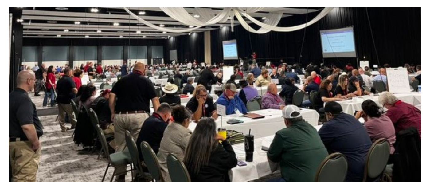
Various emergency management agencies set up for the hurricane tabletop exercise