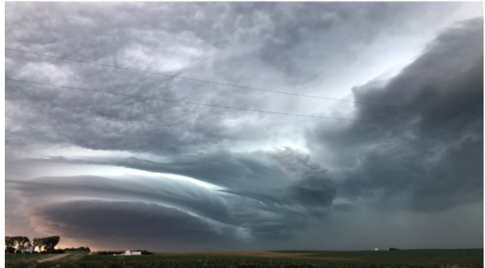
The leading edge of storms moving into the Le Mars, Iowa area.

This August marks one year since a long-lived line of severe storms known as a "derecho" caused severe wind damage across portions of South Dakota, Nebraska, Iowa, Illinois, Wisconsin, Indiana, Michigan, and Ohio on Monday, August 10, 2020. A large area from central Iowa to north central Illinois experienced wind gusts of 70-80 mph, and some areas experienced maximum wind gusts of over 100 mph. The storm system also produced 26 weak tornadoes (rated EF-0 to EF-1 with wind speeds of 65 to 110 mph) in Iowa, Wisconsin, Illinois, and Indiana, although damage from the tornadoes was similar in magnitude to that caused by the straight-line winds covering a much larger area.