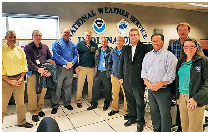
Pictured above are NWS and IDEM Air Quality Group forecasters.

The NWS forecasters shared tools and techniques they use that may help IDEM staff prepare more accurate air quality forecasts. NWS staff also discussed our Weather-Ready Nation vision and Ambassador initiative. The visit was so productive, NWS staff plan to visit IDEM and expand collaboration to IDEM's Water Quality Group.