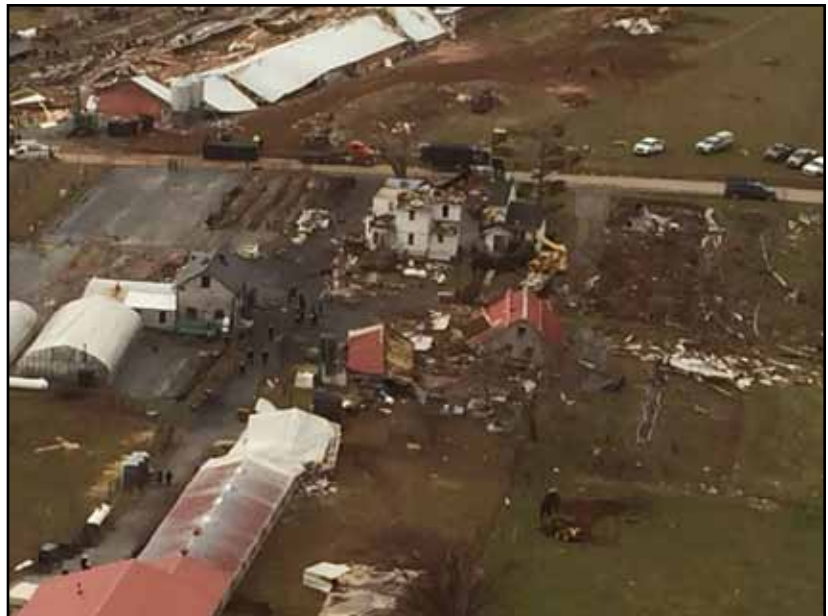
Damage caused by an EF2 tornado which struck near White Horse, PA, on February 24, 2016