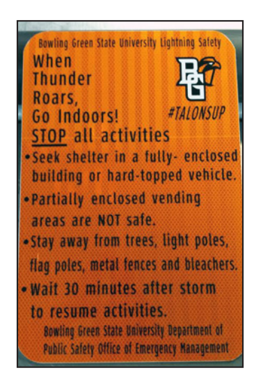
Lightning safety sign at Bowling Green University