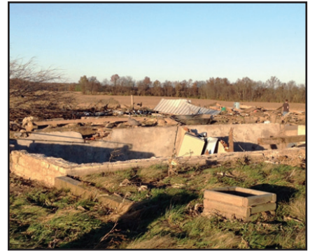
A farm house is completely destroyed and swept from its foundation southwest of New Minden, IL on November 17, 2013.

She and her two children ran out of the mobile home into a creek bed about 300 yards away. They huddled in waist deep water as the tornado passed by.