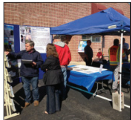
Enterprise Open House booth.