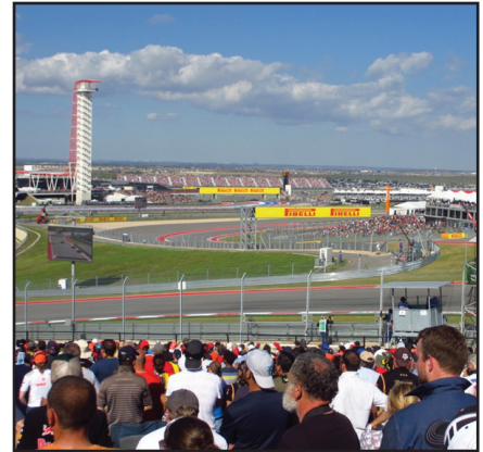
Some 120,000 spectators watch the United States Grand Prix on November 17, 2013.

WFO Austin-San Antonio and CWSU Houston coordinated detailed aviation weather guidance and impacts briefings for the expected massive increase in private aircraft and helicopter operations. The combined efforts paid off when low clouds and fog hampered aviation