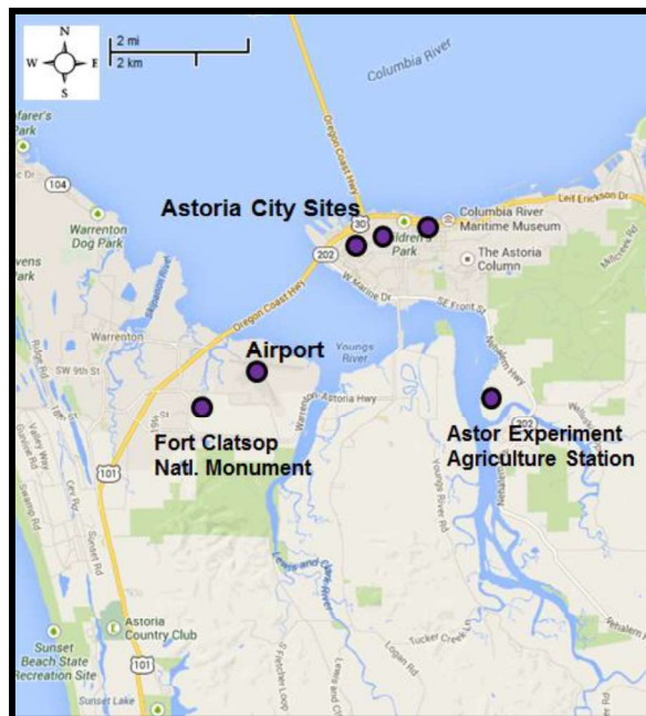
Fig 3: Observation sites around Astoria.

Between 1883 and 1953, the Astoria station moved about several locations in downtown Astoria ( figure 3 ). In 1953, the United States Weather Bureau (USWB) established a new first-order weather station at the Clatsop County Airport, located to the southwest of downtown Astoria on the west side of Youngs Bay. Staff now observed and recorded weather observations 24 hours per day. The primary reason for the new weather station was due to the increased air traffic along the coast. Many of the aircraft needed to land and refuel between the two cities. Astoria, like North Bend and Newport, became stopping points for aircraft. The new weather stations supplied weather information to pilots, making these pilot weather briefings a significant operation and the new offices. Old weather equipment was replaced, and other equipment such as wind anemometers and barometers were added. In