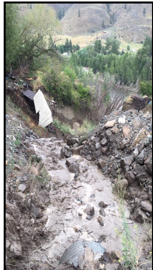
Flash flooding & debris flows in Cascades, July 22nd