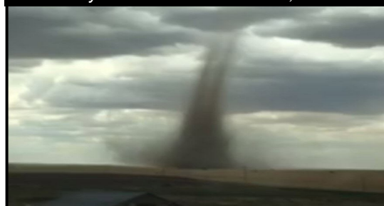
July 22nd Tornado near Mold, WA