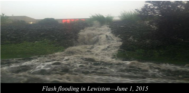
Flash flooding in Lewiston—June 1, 2015

The month of June started off innocently enough. A cold front on the 1 st brought heavy rain to the region with thunderstorms producing flash flooding. Hayden, ID measured 3.25-4.75" of rainfall, while Colbert, WA picked up 2.28". Lewiston had 0.70" of rain in 30 minutes which led to significant flooding. After a few cool days behind this