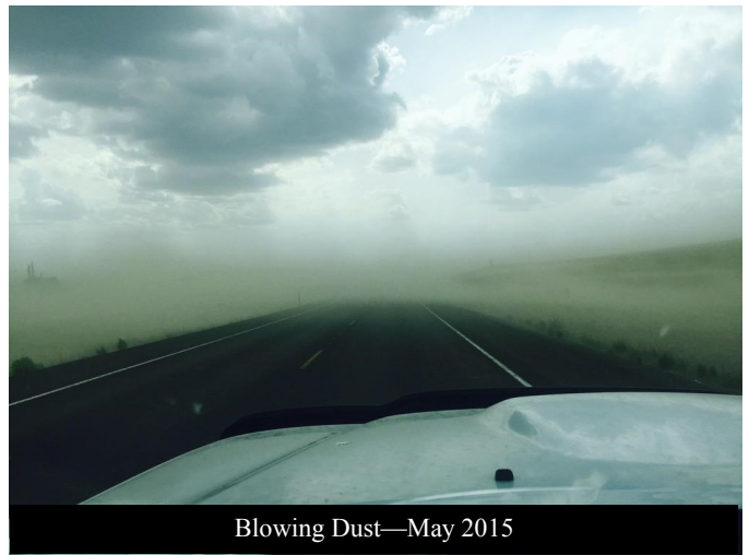
Blowing Dust—May 2015

Sound plausible? Well maybe, Yes. America's wireless industry is helping to build a Weather-Ready Nation through a nationwide text emergency alert system, called Wireless Emergency Alerts (WEA), which will warn you when weather threatens. In fact, NWS Spokane activated the WEA twice this summer for Dust Storm warnings in the Columbia Basin. If you were driving across I-90 at that time, your phone probably alerted you on the gusty winds and blowing dust. ☼ Greg Koch