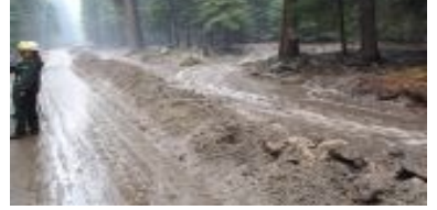
Debris flow near Pope Creek — August 14, 2014

It takes years for the vegetation to return and soils become less hydrophobic, allowing the risk of flooding to decrease.