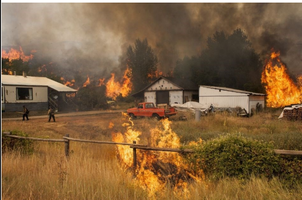
Twisp River Fire near Wenatchee—August 21, 2015

Despite the cooler and damper conditions early this September, the Inland Northwest still remains in a drought. The lack of any appreciable precipitation for much of the summer took its toll on the region. On September 8, 2015, the U.S. Drought Monitor had the Inland Northwest under an extreme drought. This extreme drought area stretched from the Canadian border south across eastern Oregon into California. This summer heat and precipitation deficit exasperated the fire season and lead to a record number of wild fires across the West. The seasonal drought outlook does not look promising. With the onset of a strong El Nino, drought conditions are forecast to persist or possibly intensify through the end of the autumn season. So despite the return of the fall precipitation, much more rain (and snow) is needed for our dryness levels to improve and any relief to be felt. ☀ Katherine Rowden & Robin Fox