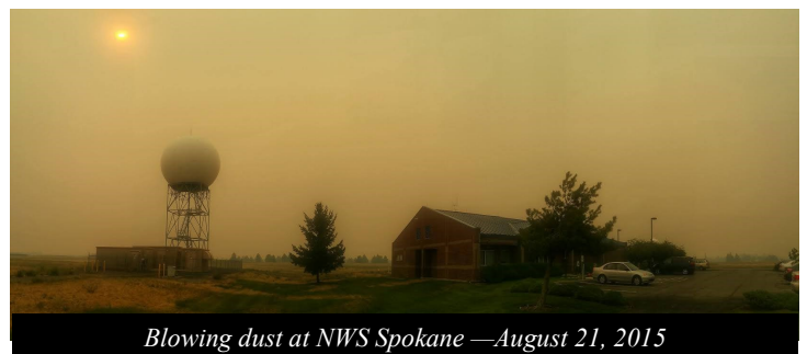
Blowing dust at NWS Spokane—August 21, 2015