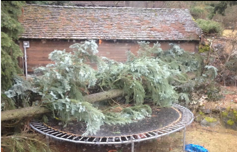
Downed tree in Spokane due to thunderstorm winds—3/14/14

Haboobs are a danger to motorists, since visibilities can drop to near zero in a matter of seconds due to the blowing dust. Also the wind gusts with a haboob can damage trees and power lines. The term haboob comes from the Middle East and is derived from the Arabic word habb, which mean wind. ☀ Robin Fox