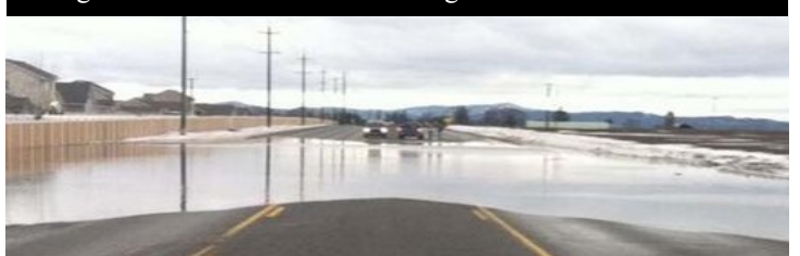
High water in Kootenai Co. closing Prairie Ave—3/11/2014