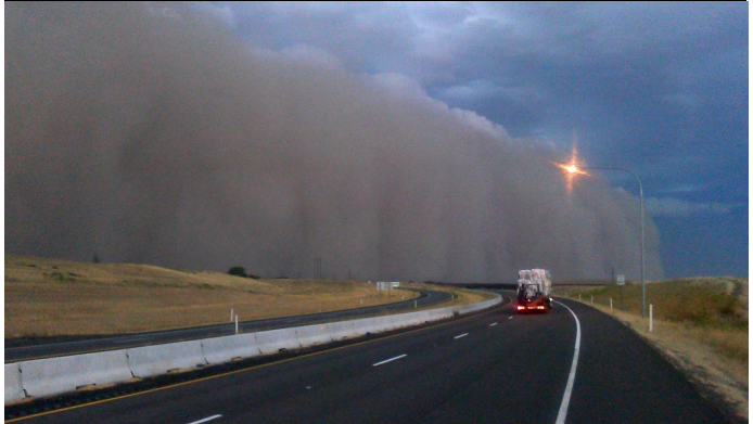
Haboob on Highway 17 near Othello, WA—9/15/2013

We appreciate your spotter reports. Feel free to send us your reports any time of the day or night. ☀ Robin Fox