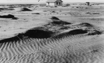
Dust Bowl Days