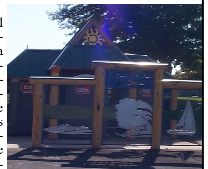
The facility at the 3rd Street boat launch

The collaborating efforts from all three of these organizations resulted in the installation of a weather radio receiver at the facility, that can be activated by boaters to get current weather information before they depart onto the lake. Over 8000 boaters use this boat launch each year. It is anticipated that the new radio and the information it provides will greatly enhance boater safety in the years to come. ☀ Ken Holmes .