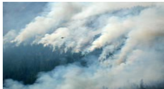
Smoke plumes from the Pot Peak Fire in the Northern Cascades

So what happened? Initial attack by fire crews suppressed many fires while they were still very small. Although a few, like the Pot Peak fire and the Fischer fire did grow large. Wet thunderstorms in late July and August brought welcomed rains to the northeastern portions of the region, suppressing an already quiet fire season in those areas. Late in August, a deep low pressure system arrived. This system brought ample moisture to the east slopes of the Cascades, helping fire fighters to contain the large fires. ☀ Bob Tobin