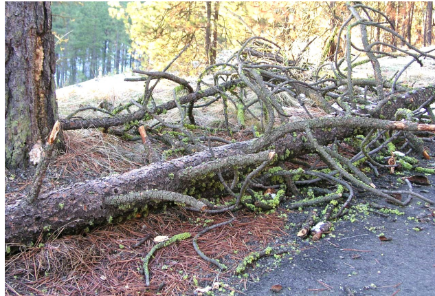
Tree damage seen around south Spokane from Nov. 19th

Between 6 and 7 am, the reports of damaging winds ranging from 60 to 70 mph began to pick up with local media calls of trees falling on houses and widespread power outages throughout Spokane. The Spokane airport measured a 63 mph gust, only 4 mph short of the all time record of 67 mph set in 1972. By 8 am, the focus of damaging winds moved into the Coeur d'Alene area. The highest gust at the Coeur d'Alene airport was 55 mph with widespread reports of fallen trees across the area.