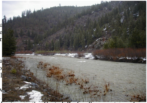
High flow on Pine Creek near Pinehurst, Idaho on February 22nd.