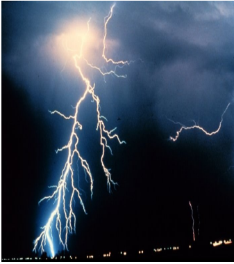
Multiple cloud-to-ground and cloud-to-cloud lightning strokes during night-time. Observed during a night-time thunderstorm.