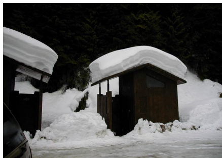
Heavy snow observed near 4th of July summit on February 22nd.

Near-normal temperatures prevailed through much of February. By the end of the month changes were once again in store. Another windy southwesterly system on the 22 nd warmed temperatures into the 50s and lower 60s in many locations, melting some of the low-level snow and making it feel like early spring. But thoughts of spring were put on hold as a cold Canadian air mass took up residence over the Inland Northwest. Temperatures stayed below freezing in Spokane from the 24 th through the 27 th , making it the coldest stretch of the winter. Temperatures around the region were 10 to 20 degrees below normal for the last week of February. Even so, temperatures for the month were above normal in Wenatchee and Lewiston. Precipitation was near or below normal. Wenatchee has had below normal precipitation for 21 of the past 24 months. ☀ Ron Miller