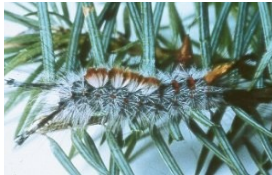
Douglas Fir Tussock Moth in caterpillar stage