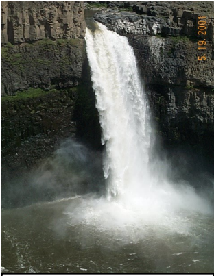
Palouse Falls during peak flow this spring. It is located on the Whitman and Franklin county border in eastern Washington .