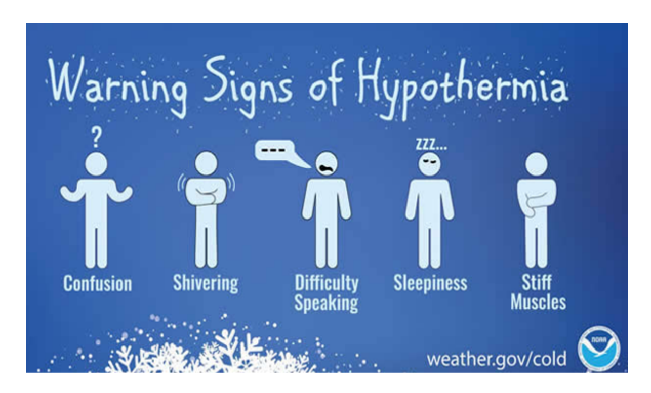
Warning signs of hypothermia

2010, and an additional 7 people were injured from carbon monoxide poisoning resulting from improper use of heating devices. South Florida's agricultural industry suffered losses in the millions of dollars as a direct result of the freezing temperatures.