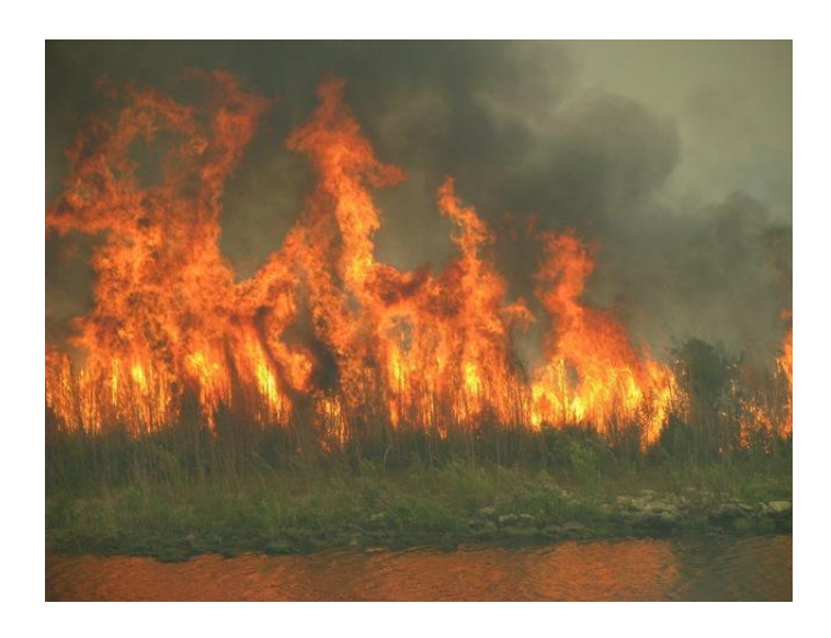
Wildfire on a dry grass bed in Lake Okeechobee

The typically dry winter and spring of South Florida means that our area is prone to prolonged periods of little to no rainfall. This increases the threat of wildfires which peaks during the spring months from March through May when the dry season coincides with windy conditions, increasing sun angle, and warmer temperatures. Wildfires are not only most common in the Everglades, but also near the urban-wildland interface on the fringes of the urban areas of South Florida. This was the case during the spring of 2017 when several weeks of little rainfall led to severe drought conditions over Southwest Florida. The result was one of the worst wildfire seasons in recent memory in Southwest Florida. Three wildfires affected the Golden Gate Estates and Picayune State Forest in March and April of that year. Total damage caused by those wildfires was over $4 million, with 18 structures destroyed. The wildfires triggered the evacuation of portions of Golden Gate and the closing of roads, schools, and businesses in the area. Fortunately, no deaths were reported and one man was injured while trying to save his property from the fire.