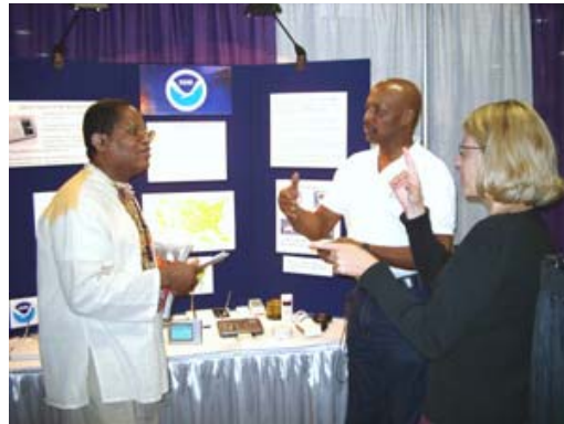
NWS Staff at Deafway II Booth at D.C. Convention Center

Gallaudet University hosted Deaf Way II at the Washington, DC Convention Center July 8-13, 2002. This was an international event with 9,000 attendees from around the world. It included deaf, hearing, hard of hearing, late-deafened, deaf-blind, parent, student and more. During the three days