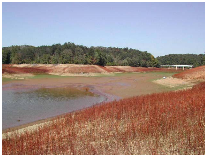
Prettyboy reservoir on Oct 6,2002.

THE LONG TERM DROUGHT CONTINUES IN BALTIMORE. FOR THE 12 MONTH PERIOD SEPTMBER 1ST 2001 TO AUGUST 31ST 2002, BWI AIRPORT HAD RECEIVED ONLY 26.33 INCHES OF RAIN. THAT IS THE DRIEST ON RECORD FOR THAT 12 MONTH PERIOD.