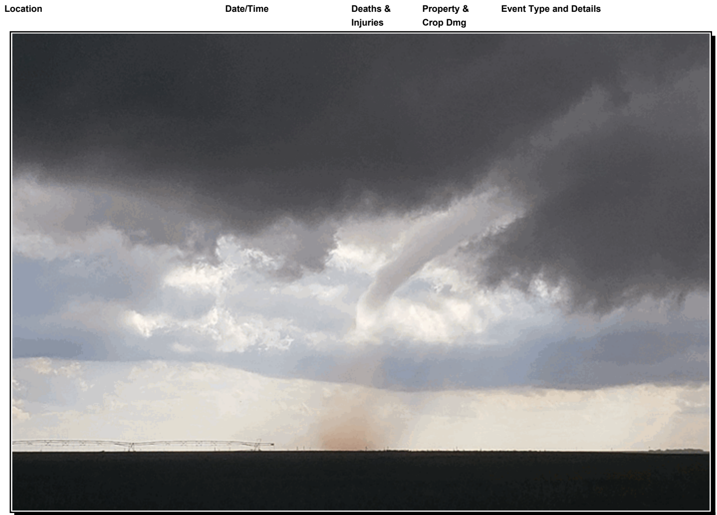
This EFU tornado drifted east over cotton fields west of Brownfield, TX.