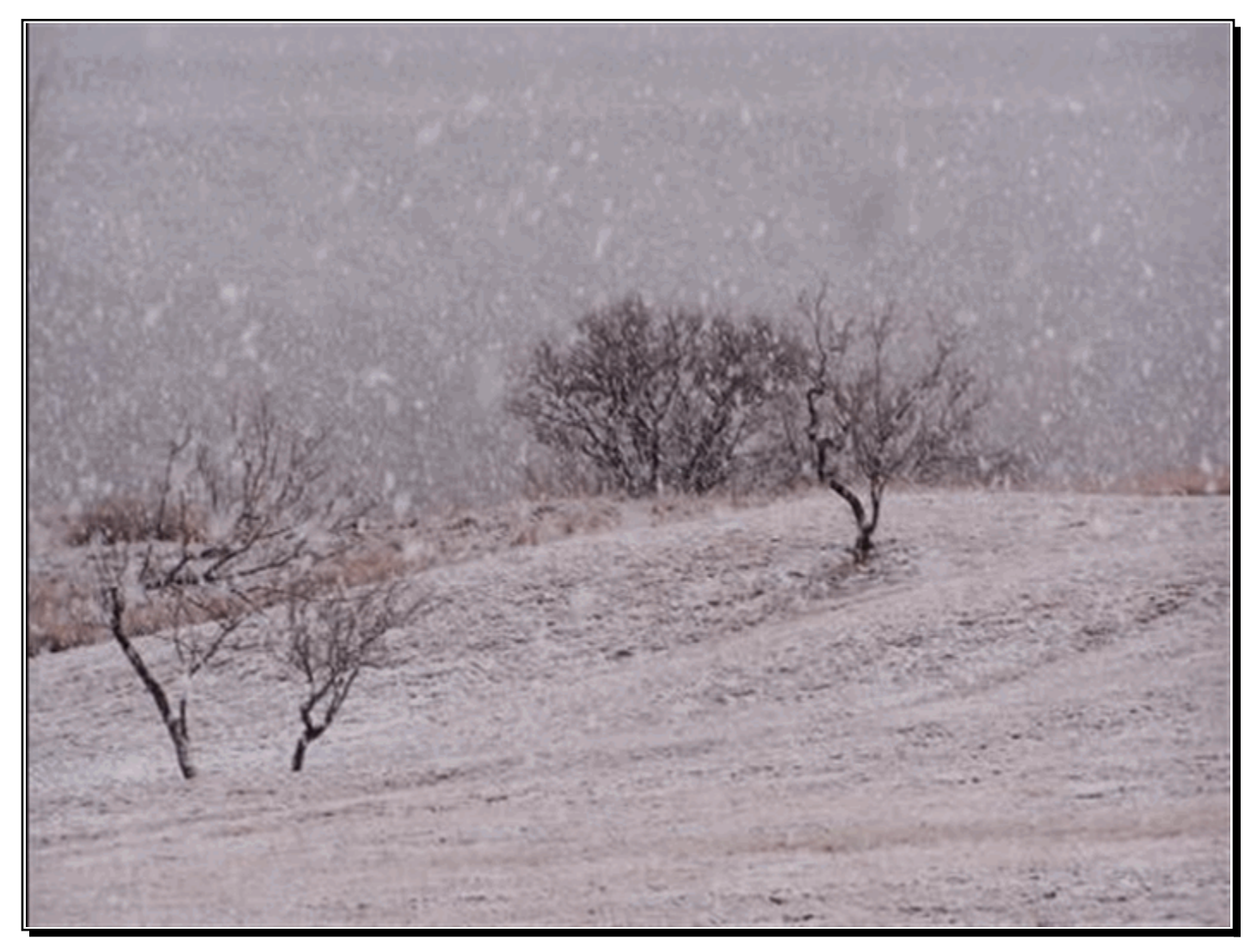
Snowfall resulted in 1 inch accumulations near Floydada (Floyd County) during the afternoon hours of the 15th.

Rain transitioned to snow during the afternoon hours, and persistent upslope winds along the Caprock escarpment contributed to localized 1 inch to 2 inch accumulations over a small portion of the central South Plains. Public impacts were minimal. A list of reported snow accumulations follows: 2 inches in Southland (Garza County), 1 inch in Crosbyton (Crosby County), 1 inch in Floydada (Floyd County), 1 inch in Slaton (Lubbock County), and 1 inch in Tahoka (Lynn County).