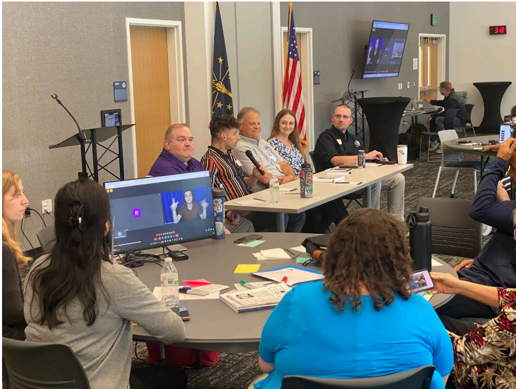
An online ASL interpreter presents to deaf and hard-of-hearing participants at the conference.