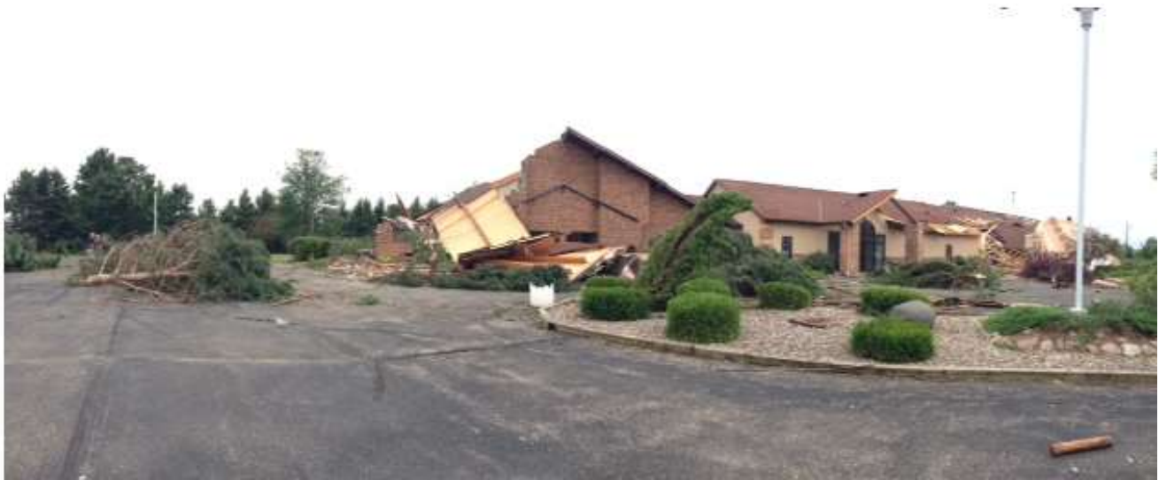
Figure 1: Church (southeast New London) damaged by a tornado. Peak winds were estimated at 115 to 120 mph.