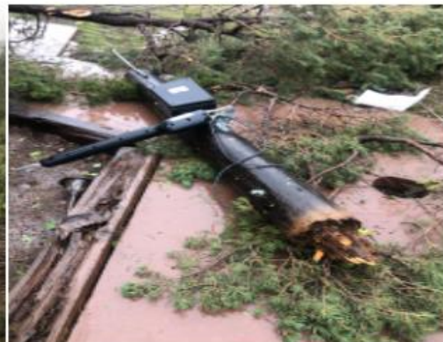
Broken electrical line.