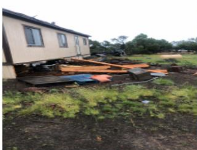
Manufactured home slid off of its foundation.

A very narrow corridor of damage to trees, outbuildings, recreational vehicles, and residential structures were noted. The narrow nature of the damage path, orientation of the wind damage in conjunction with radar evidence yields high confidence to attribute the destruction to that of an EF-1 tornado with peak winds estimated around 95 to 100 mph. No injuries or fatalities have been reported with the tornado. In addition to the tornado, the storm produced copious amounts of quarter size hail, with a few residents noting hail to the size of golf balls.