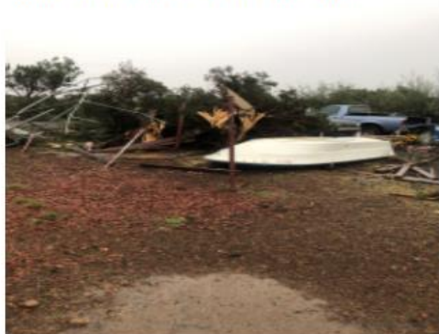
Snapped tree trunks.