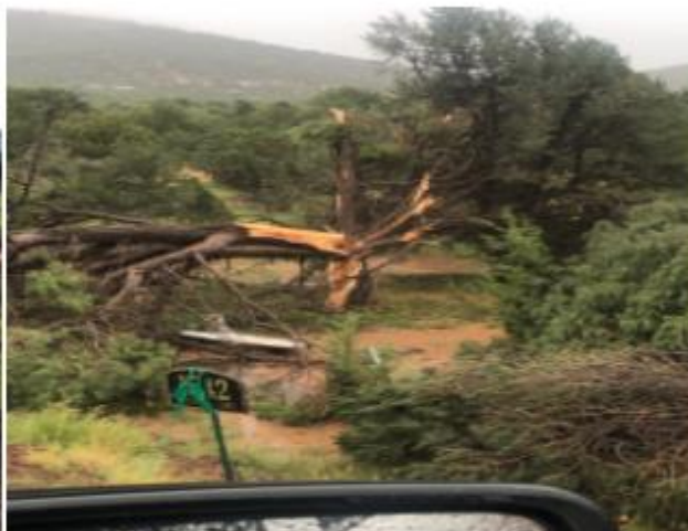
Large tree trunk snapped.