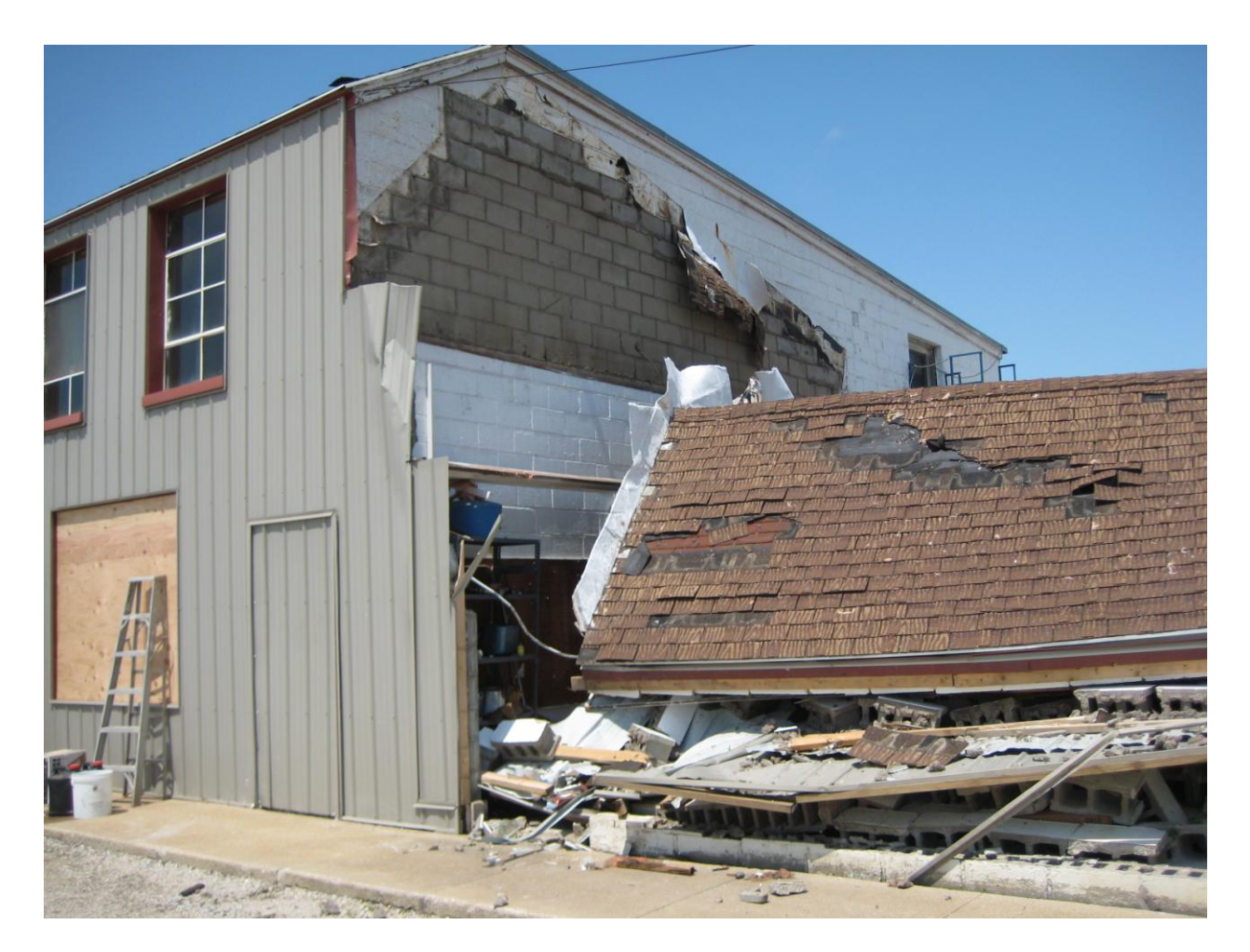
Figure 7. The cinder block wall of this building collapsed and the roof was torn off the side of the parent building in eastern Pocahontas.