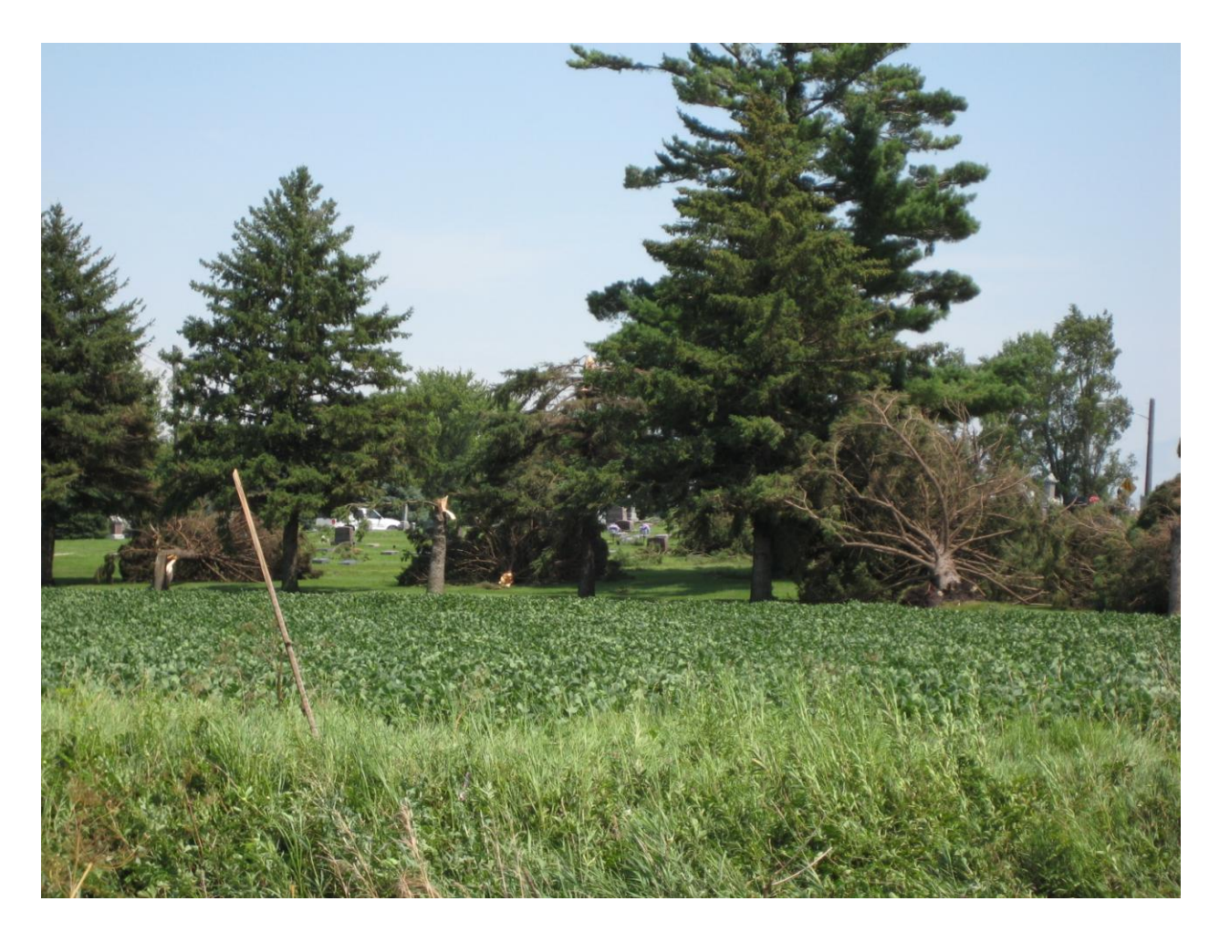
Figure 5. Large trees snapped off near cemetery in southeast Pocahontas.