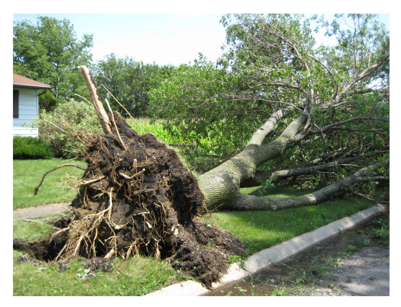
Figure 4. A large tree uprooted on the south end of Pocahontas.