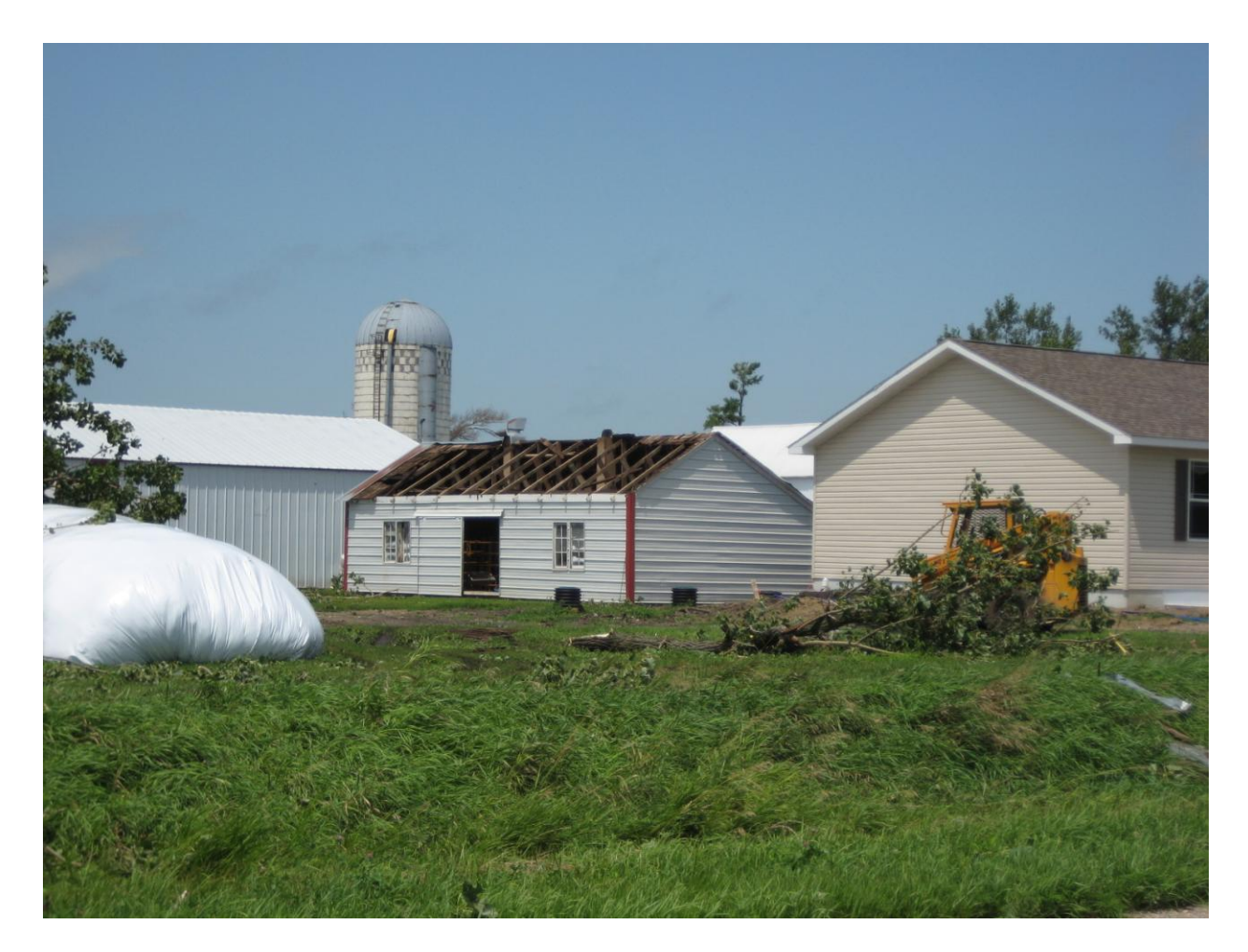
Figure 3. A building with roof damage near on the south end of Pocahontas.