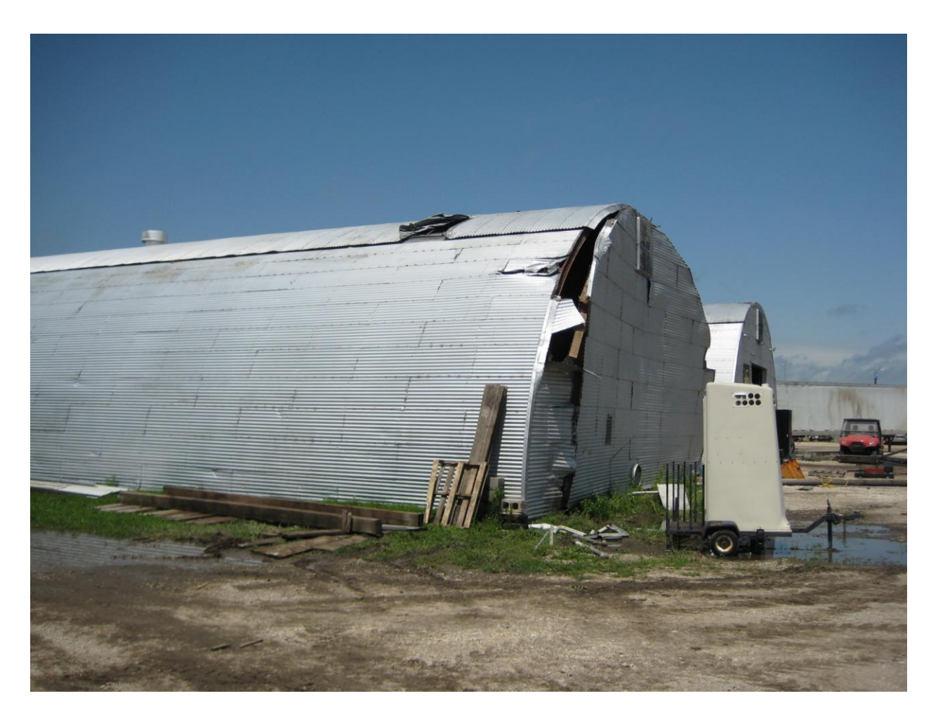
Figure 6. The end of this Quonset hut was blown out and was found laying flat on the ground. Workers had attempted to place the wall back in the vertical position by the time the photo was taken.