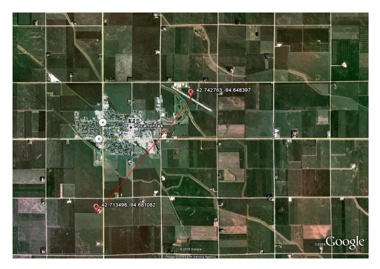
Figure 1. The locater B represents the beginning of the storm damage path and the E represents the end of the storm damage path.