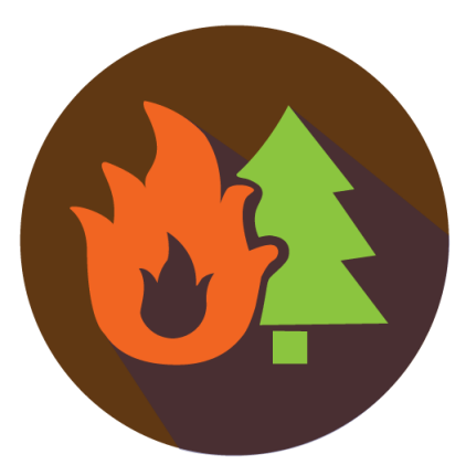
Visit <a href="https://www.weather.gov/s">https://www.weather.gov/s</a> <a href="mailto:afety/wildfire">afety/wildfire</a> for useful wildfire safety information you can share!