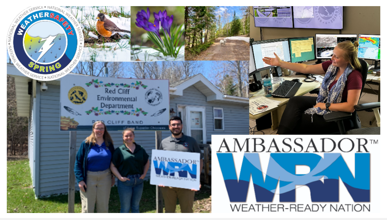
Inside the Issue