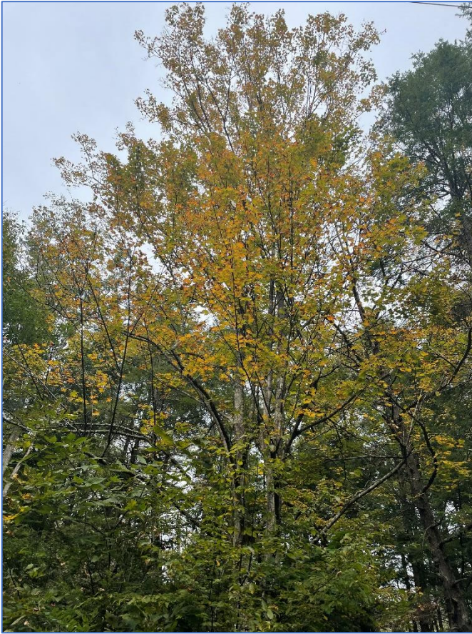
Bright sugar maple, Tuscarora State Forest.

The Perry/Juniata County service forester (Tuscarora State Forest District) reported the northern part of the district is starting to exhibit nice color on sugar maples. Black Log Valley's abundant sugar maples are transitioning to vibrant color, with contributions from dogwood and hickory too. Winding through Perry and Juniata counties, Route 850 is a recommended scenic drive.