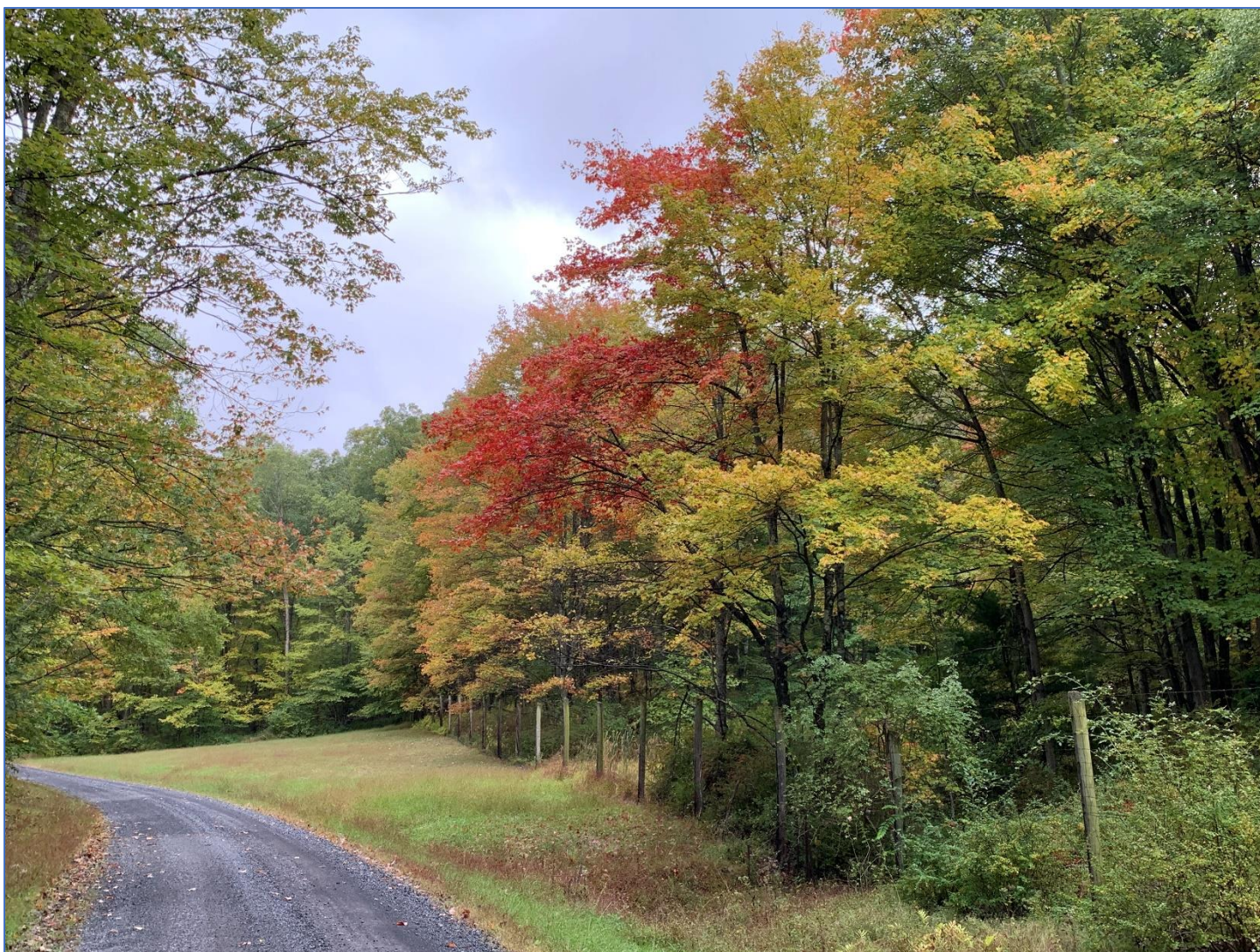
Colors are beginning to pop near Potters Mills.