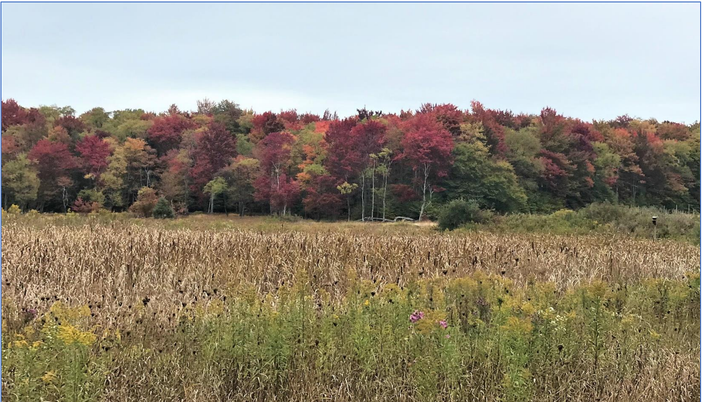
Fall colors are ramping up along Lyman Run Road.

The district manager in Susquehannock State Forest (Potter, McKean counties) said the area experienced two hard frosts since last report, accelerating the color change. The peak in the maple dominated forest of northern Potter and McKean counties is happening this week through the weekend of October 7-9. Beech, cherry, and aspen have started to turn and will continue to add good color in some areas for about the next two weeks. Oaks should start changing soon and are expected to peak around October 22-29. Brilliant colors vary widely this year probably because of the dry weather and near drought conditions this summer. Some hillsides are yellow and tan, and others are brilliant shades of yellow, orange, and red. Recommended scenic drives include routes 6, 44, 49, and 449.