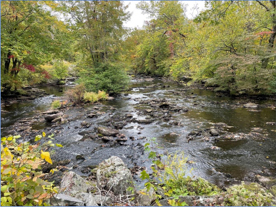
Bushkill Creek, southern Pike County.