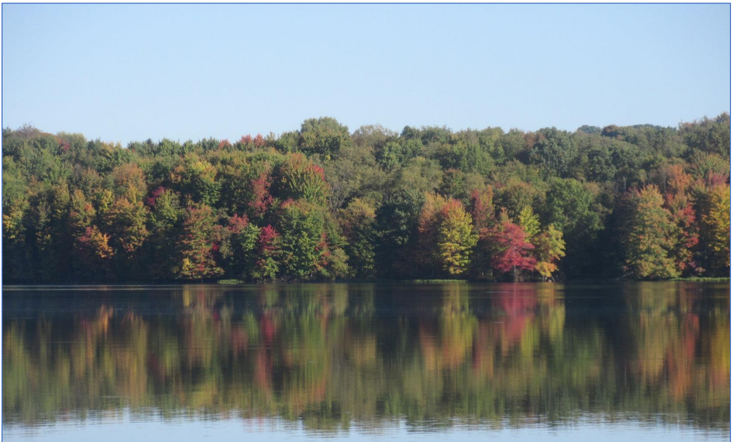
Lake Wilhelm at M.K. Goddard State Park.

Gallitzin State Forest (Blair, Indiana, Cambria counties) staff said the district is still very green except for some spotty but vibrant red maples.