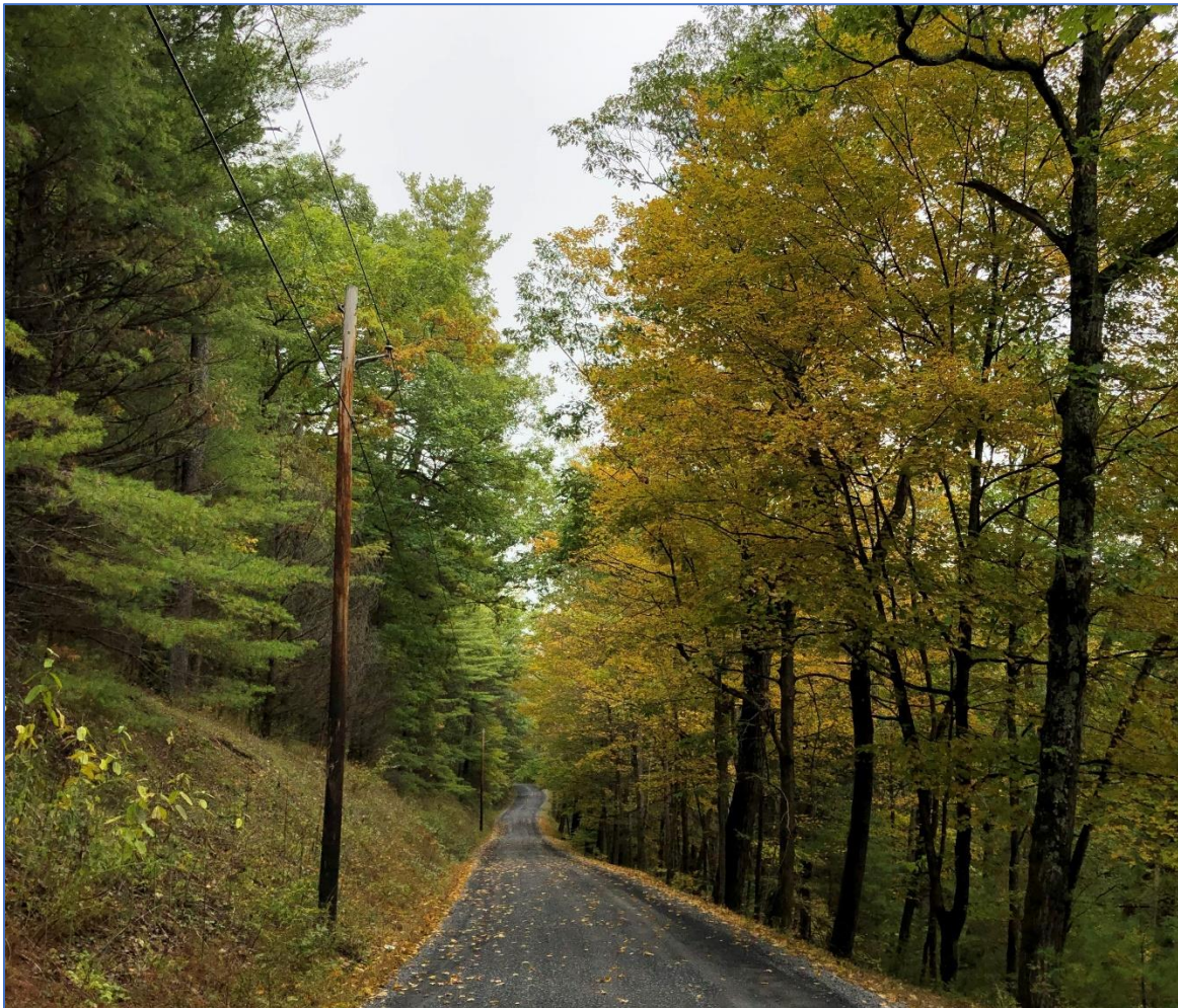
Poe Valley Road.