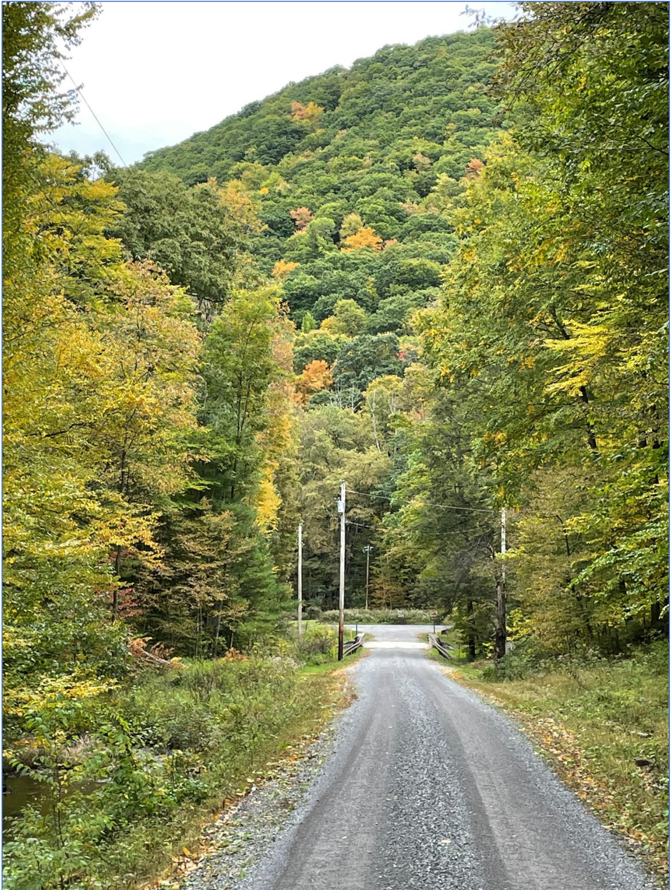
Little Medix Road, Moshannon State Forest.