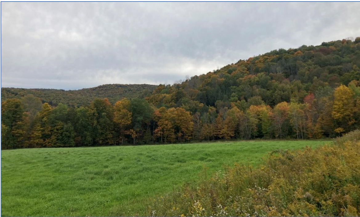
Fall colors are progressing at Salt Springs State Park.