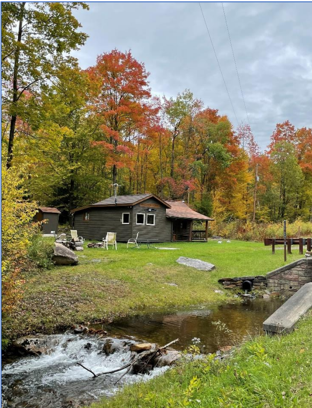
Beautiful cabin scene, Jack Dent Road, Moshannon State Forest.

Foresters in Michaux State Forest District said green is still the predominant color but fall shades are increasing in some areas. Colder nights ahead will bring more color next week.