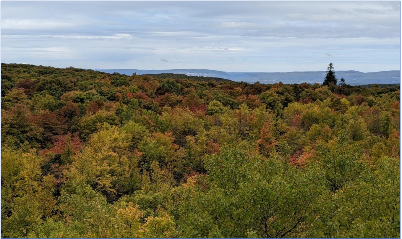
The view from Mt. Davis.