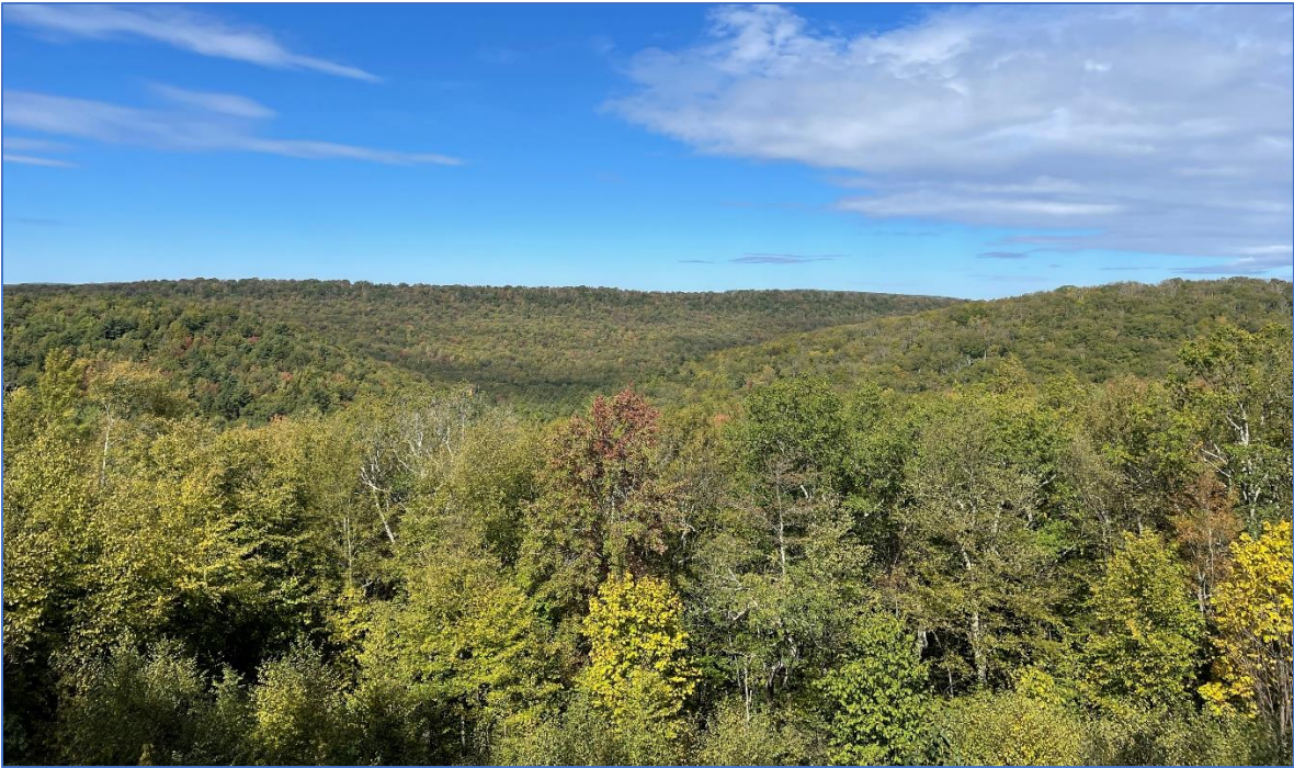
Riansares Vista, Bald Eagle State Forest.