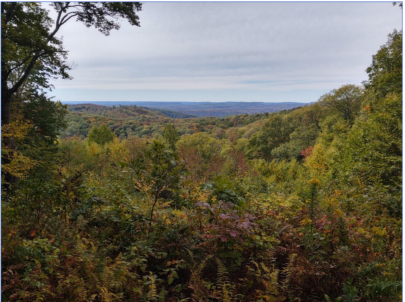
Salt Run Vista near Emporium, Cameron County.

The Elk County service forester said colors in the northern parts of Elk and Cameron counties (northern hardwood forest) are changing fast. Maples are showing nice color. The southern parts of Elk and Cameron counties (mostly oak forest) are not as vivid, except maples.