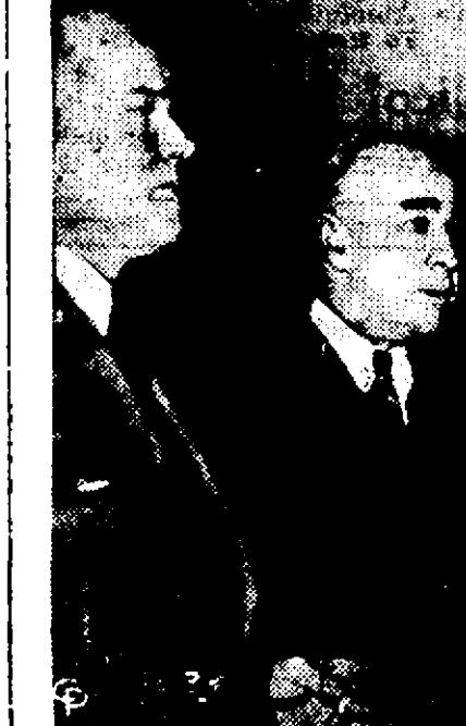
Leaders of both Democratic and Republican parties in Philadelphia have been summoned before the federal grand jury there.