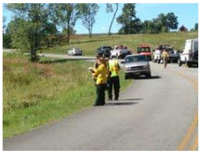
Fire personnel taking weather observations during the prescribed burn. \square

By the early afternoon, all of the favorable meteorological variables were in place. Temperatures had warmed to nearly 70° F, winds were 3-7 mph, and humidity values were around 40%. Despite these conditions, a fire could not be started as the fuel moisture had remained too high. The fuel (grass) was also too "green", with very little cured fuels available, hindering ignition. The long-term soil moisture anomaly was also high, helping to keep the fuel moisture high. Perhaps if the winds had been a little stronger in the morning, the dew might have evaporated quicker, helping the fuel moisture to lower, and thus increasing the burn potential. Regardless of the outcome, prescribed burns such as the one that was attempted at the Saratoga NHP on September 6 show how crucial a role meteorology plays in fire behavior.