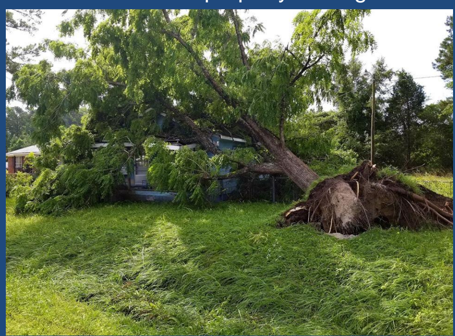
Downburst winds in New Bern June 24, 2018 caused downed trees.

June 2018 was warm and rather wet across eastern North Carolina. Abnormally warm minimum temperatures contributed heavily to the warm mean temperature in June. With the exception of the far northwestern Coastal Plains, and portions of the Central and Northern Outer Banks, much of the area was above normal in rainfall, with a corridor from New Bern to southern Washington County some 2 to 5 inches above normal. There were a few severe weather episodes late in the month, including a downburst in the New Bern area on June 24 that caused numerous downed trees and minor property damage.