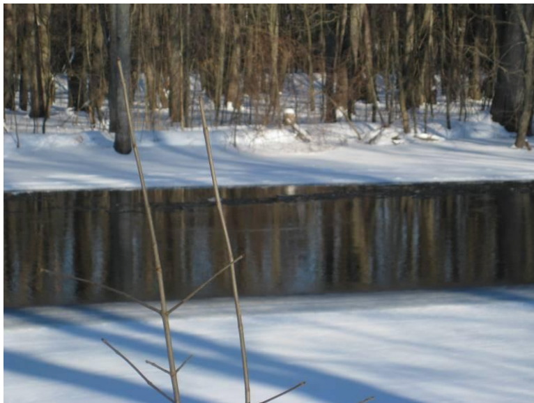
Figure 8. Frazil slush upstream