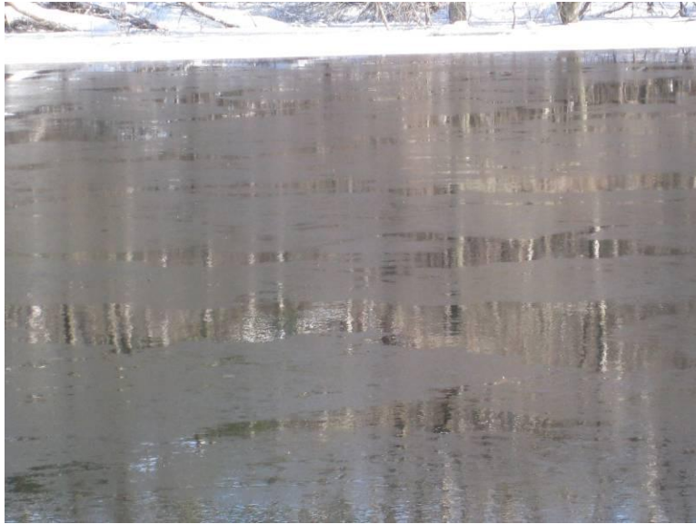
Figure 5. Thin layer of frazil slush on water surface

Walton and Daly next viewed the downstream toe of the ice cover that had formed at the Route 10 Bridge. The ice covered extended upstream and no ice was issuing from beneath the ice cover (Figure 6). The leading edge of the ice cover downstream of the gage was visible from the bridge (Figure 7). They then traveled upstream to a small development near the County Route 66 Bridge where the river was partially open and frazil slush and small floes were carried downstream (Figure 8). Next they traveled downstream to the 50 th Avenue Bridge where the river was also open and frazil slush and small floes were carried downstream (Figure 9, Figure 10 and Figure 11). Finally they viewed the river from the County Supervisor's home, from a location downstream of the 50 th Avenue Bridge where the river was completely ice covered (Figure 12).