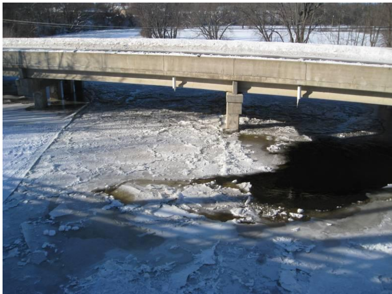
Figure 6. Looking upstream at the downstream extent of ice cover at the Route 10 Bridge

Walton and Daly next viewed the downstream toe of the ice cover that had formed at the Route 10 Bridge. The ice covered extended upstream and no ice was issuing from beneath the ice cover (Figure 6). The leading edge of the ice cover downstream of the gage was visible from the bridge (Figure 7). They then traveled upstream to a small development near the County Route 66 Bridge where the river was partially open and frazil slush and small floes were carried downstream (Figure 8). Next they traveled downstream to the 50 th Avenue Bridge where the river was also open and frazil slush and small floes were carried downstream (Figure 9, Figure 10 and Figure 11). Finally they viewed the river from the County Supervisor's home, from a location downstream of the 50 th Avenue Bridge where the river was completely ice covered (Figure 12).