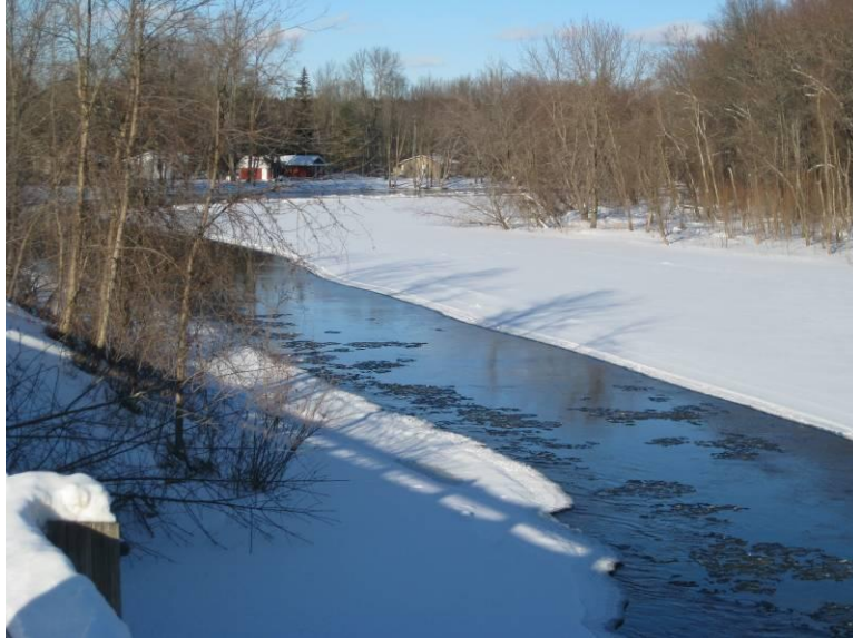
Figure 9. Frazil slush and small floes