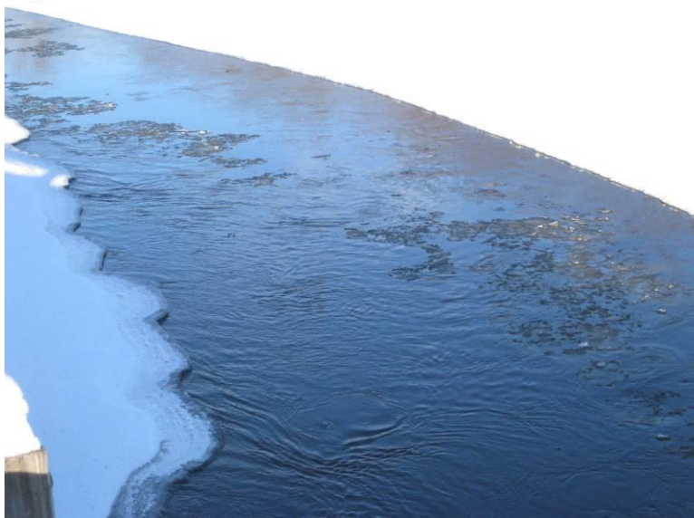
Figure 10. Frazil Slush and small floes