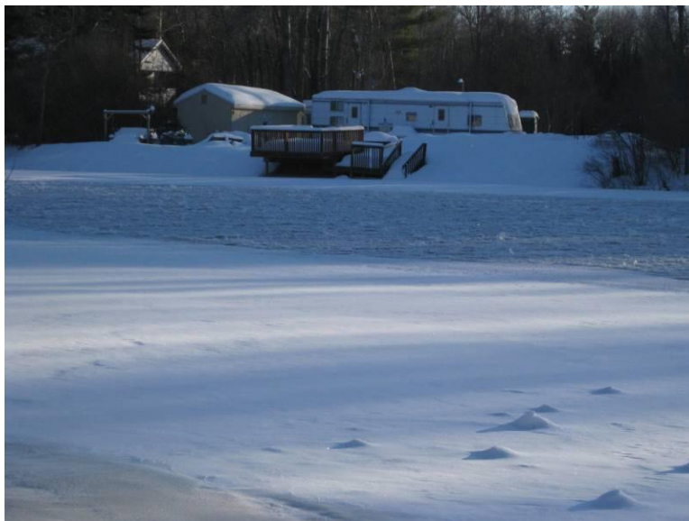
Figure 12. View from County Supervisor's home. River was completely ice covered.

Discussion: The area around Ewart, MI has abundant ground water reserves as seen in the many flowing artesian wells in the area. The large influx of ground water impacts the Muskegon River water temperature and reduces the ice production in the river. Freeze up is an unusual occurrence in Ewart. The frigid, sub-zero air temperatures in Ewart in the days preceding the observed freeze up were apparently cold enough to generate sufficient ice to cause the river to freeze up. The impact of freeze up was to cause the river stage to rise. Once freeze up had occurred the stages stop rising. This can be seen in the gage results shown in Figure 1. Following freeze up, the influx of warmer ground water caused the underside of the ice cover to smooth and the natural decrease in flow lead to the slow decline of stages, as also seen in Figure 1.