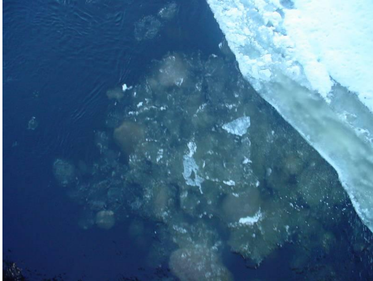
Figure 11. View of floes