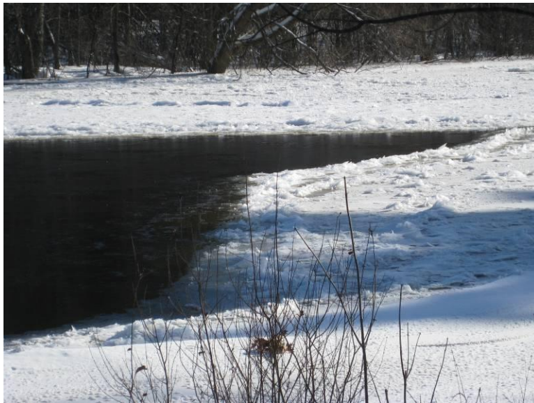
Figure 4. Leading edge downstream of gage