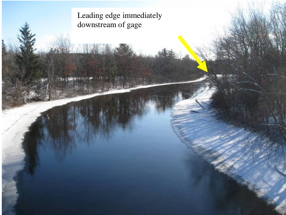
Figure 7. Looking downstream from Route 10 Bridge at the leading edge of the ice cover immediately downstream of gage. The gage is on the right bank in this view.