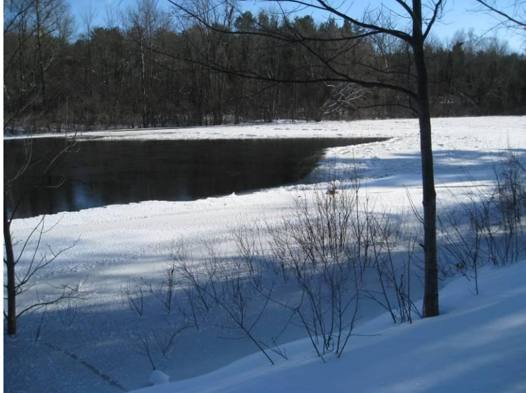
Figure 3. Leading edge downstream of gage