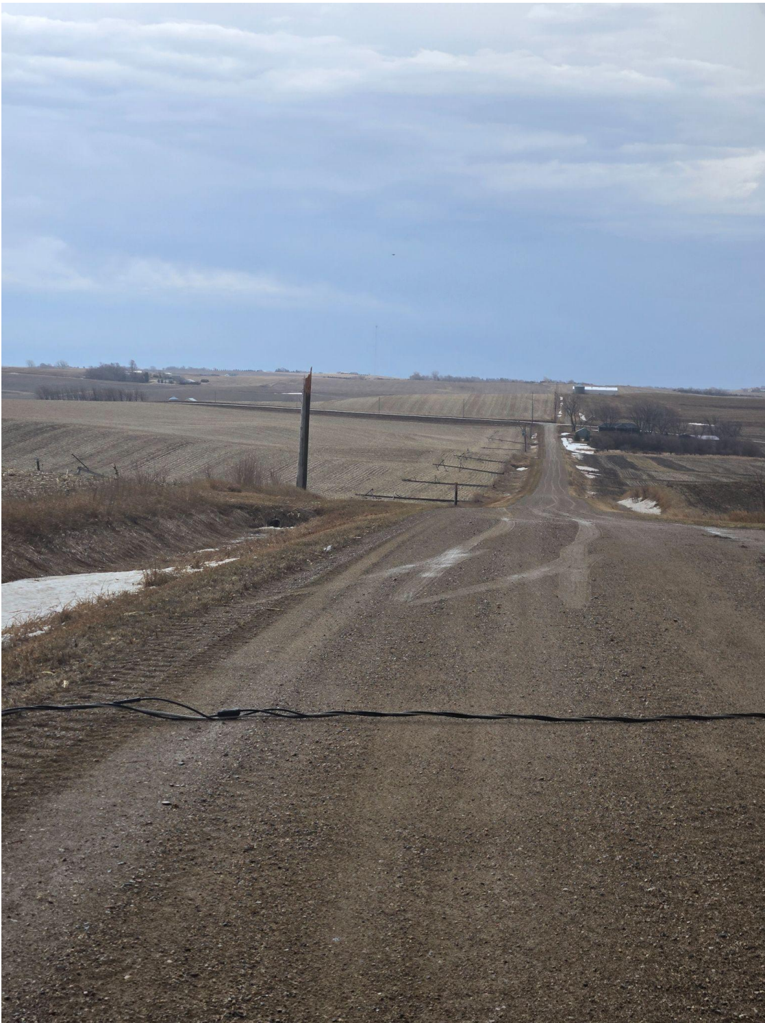
Power poles snapped northwest of Carroll, IA.