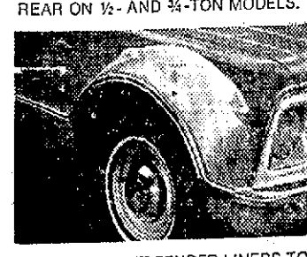
SPECIAL FRONT FENDER LINERS TO