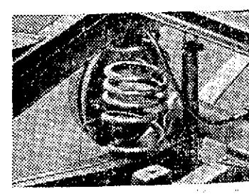
TOUGH COIL SPRINGS FRONT AND REAR ON 1/2- AND 1/4-TON MODELS.