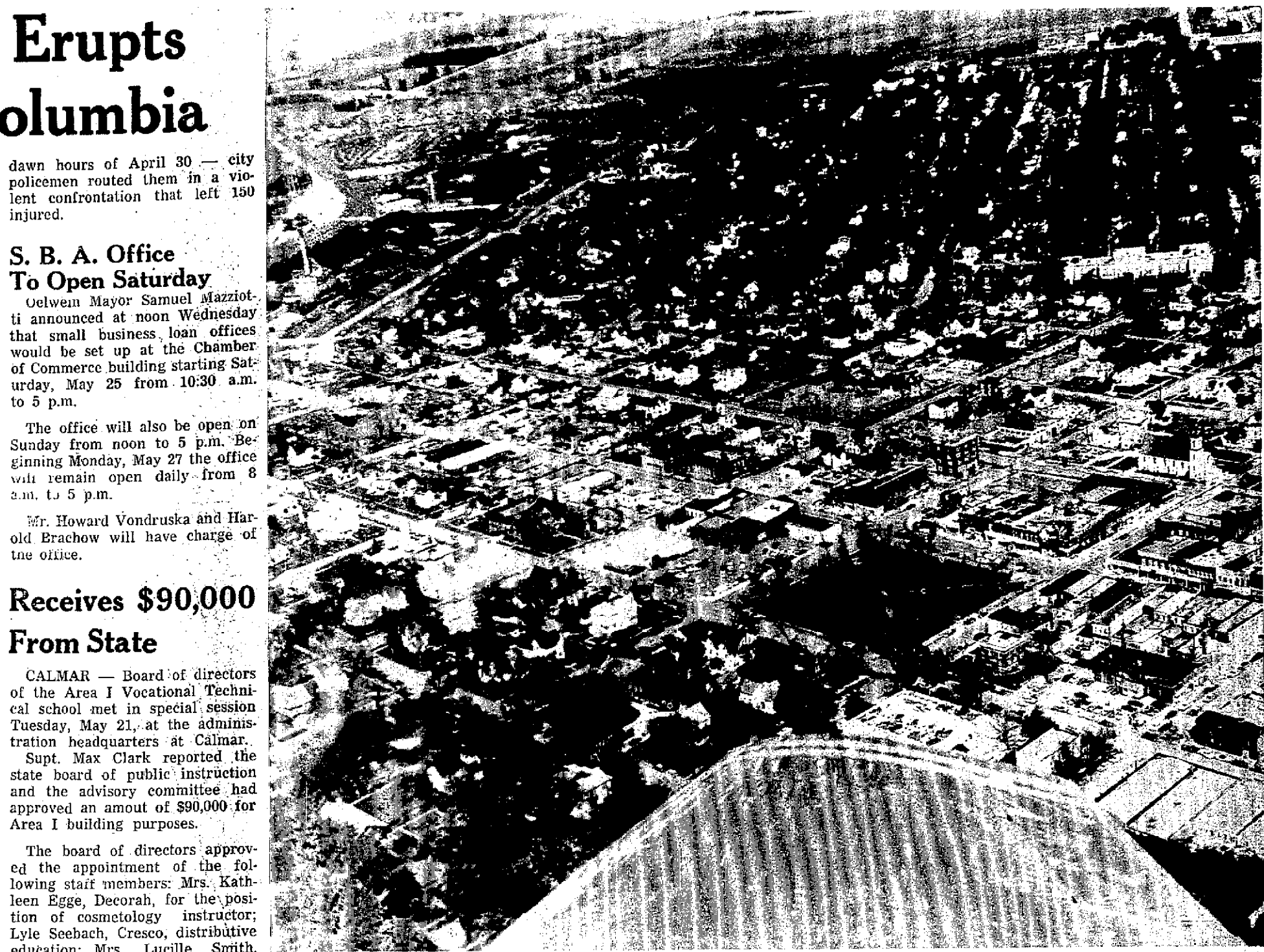
CHARLES CITY DESTRUCTION—Hundreds are homeless, and some still not located in the Charles City area after the twisters of Wedness day, May 15th left Oelwein and apparently headed for that area. The downtown section of the city appears from the air as though it had been hit with bombs similar to those of World War II in Europe. Fourteen persons lost their lives in the area depicted in this Oelwein Daily Register photo. Businesses, churches, and individual homes and autos were swept away like so much pulp wood during the devas-