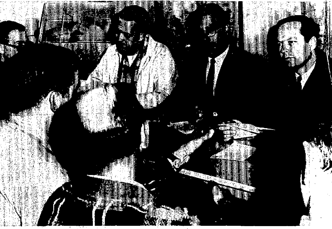
RILEY MEETS WITH CITY COUNCIL—Senator Tom Riley arrived in Oelwein at 3 p.m. Tuesday to discuss with Mayor Samuel Mazziotti and city council members all available federal and state assistance. Riley was in the city the night of the tornado and has since conferred with Des Moines and Washington officials in an attempt to gather information that wilt help city officials receive aid of all types for reconstruction.