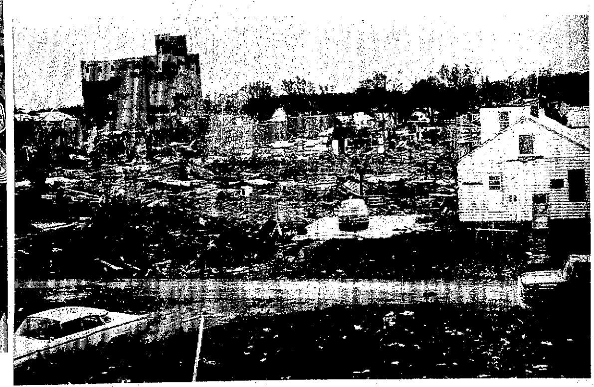
MOST PERSON'S WOULDN'T, or couldn't believe what they were seeing in the town of Maynard when the tornado passed and left the above desolated area. It happened-they began to realize it, and went to work.