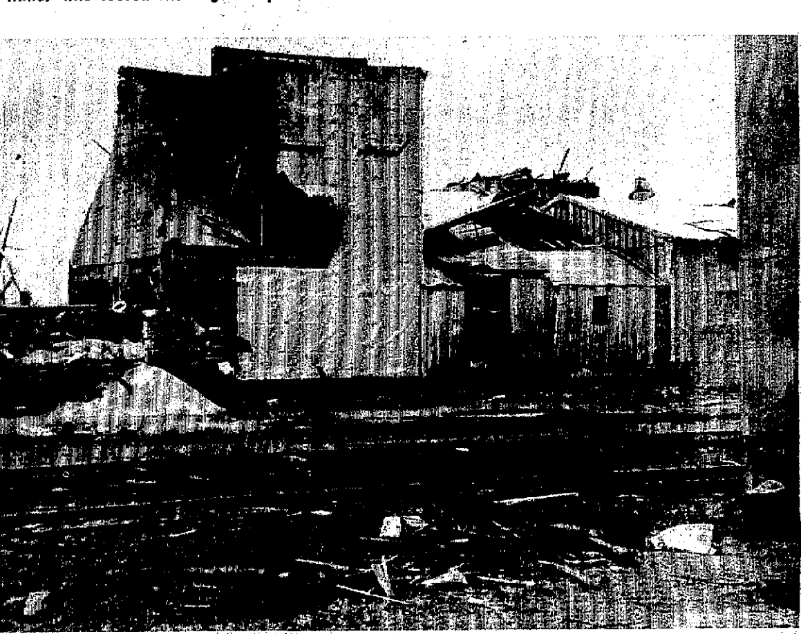
MAYNARD—NO ONE KNOWS, nor has had the time to figure out the amount of financial damage to the town of Maynard during the worst area disaster to strike in the history of the town or area. The above shot of Maynard Co-op indicates just a part of the overall destruction experienced by the within a few feet of the above structure and the entire west end of the town either was flattened, or taken along with the twin twisters. Declared a disaster area, students from throughout the area proved to be men and women of the town when they got the word and volunteered their services.