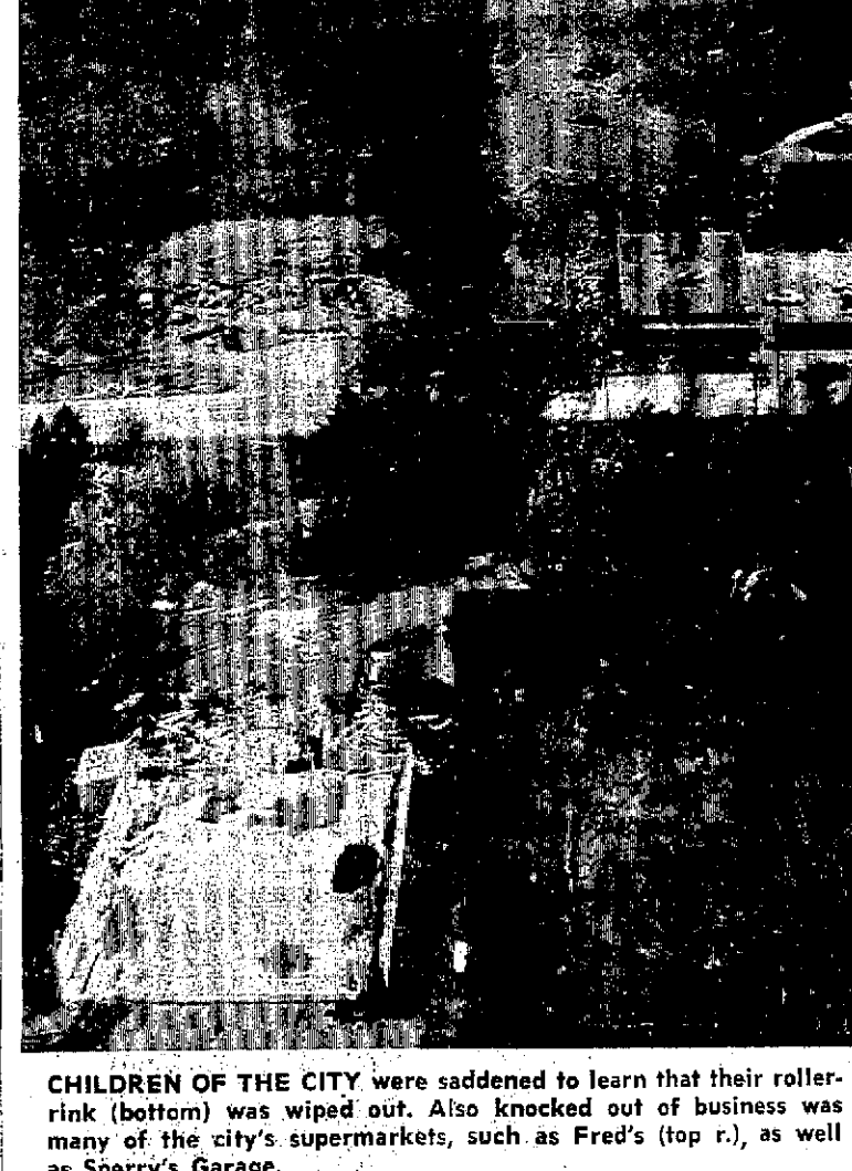
as Sperry's Garage.