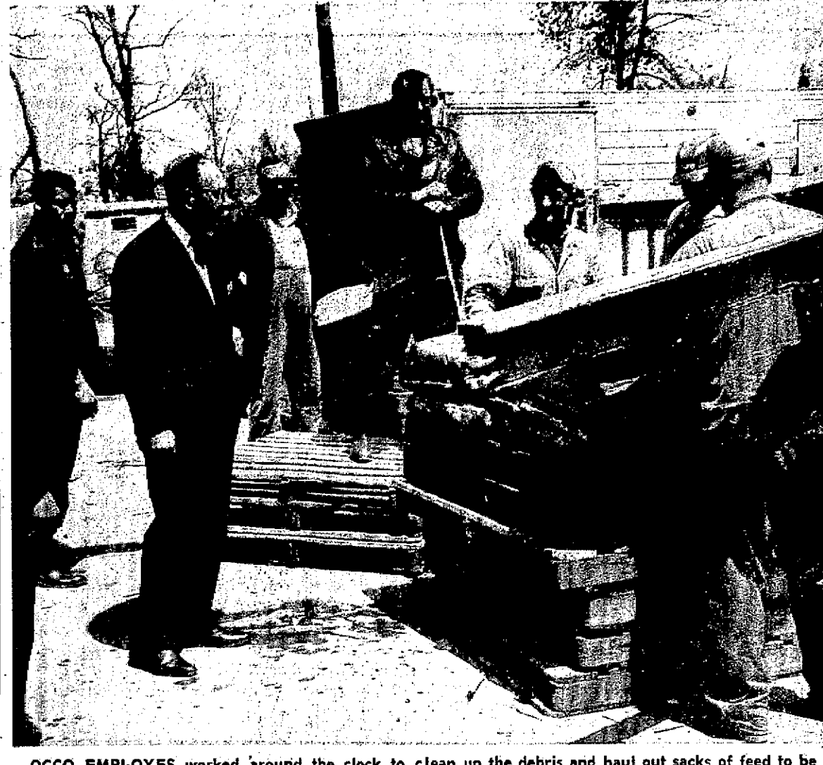
OCCO EMPLOYES worked around the clock to clean up the debris and haut out sacks of feed to be shipped to Independence for storing. They stopped long enough to answer questions by Senator Jack Miller who toured the huge complex.