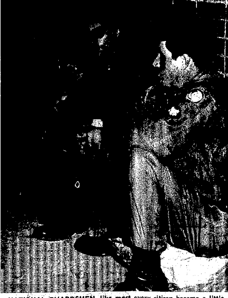
NATIONAL GUARDSMEN, like most every citizen became a little tired of it all as the hours drug on and the work began to really pile up; they took their breaks while maintaining their jobs when and where they could.