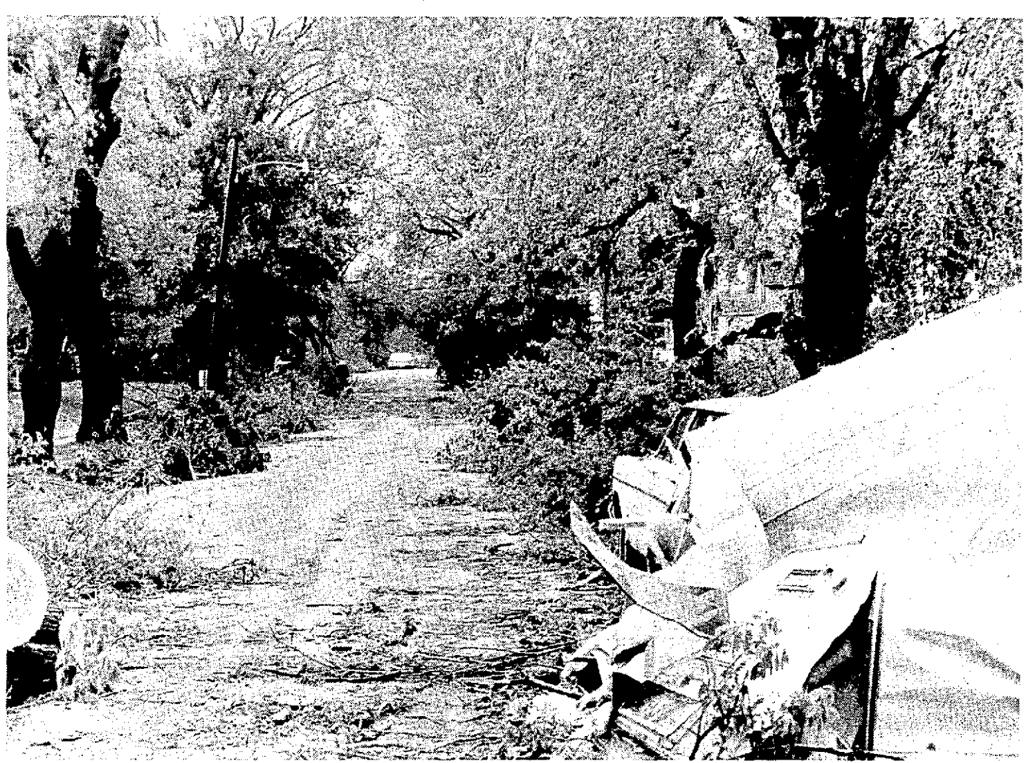
NUMEROUS WORKING units flocked to Oelwein Thursday morning to help in cutting down and clearing of several hundred trees. The picture above is an example of the damage on any given typical street in the residential area.