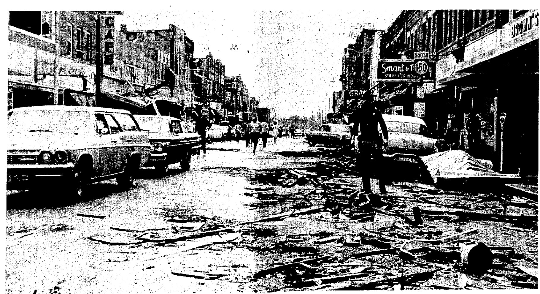
POLICEMEN step over debris on South Frederick.