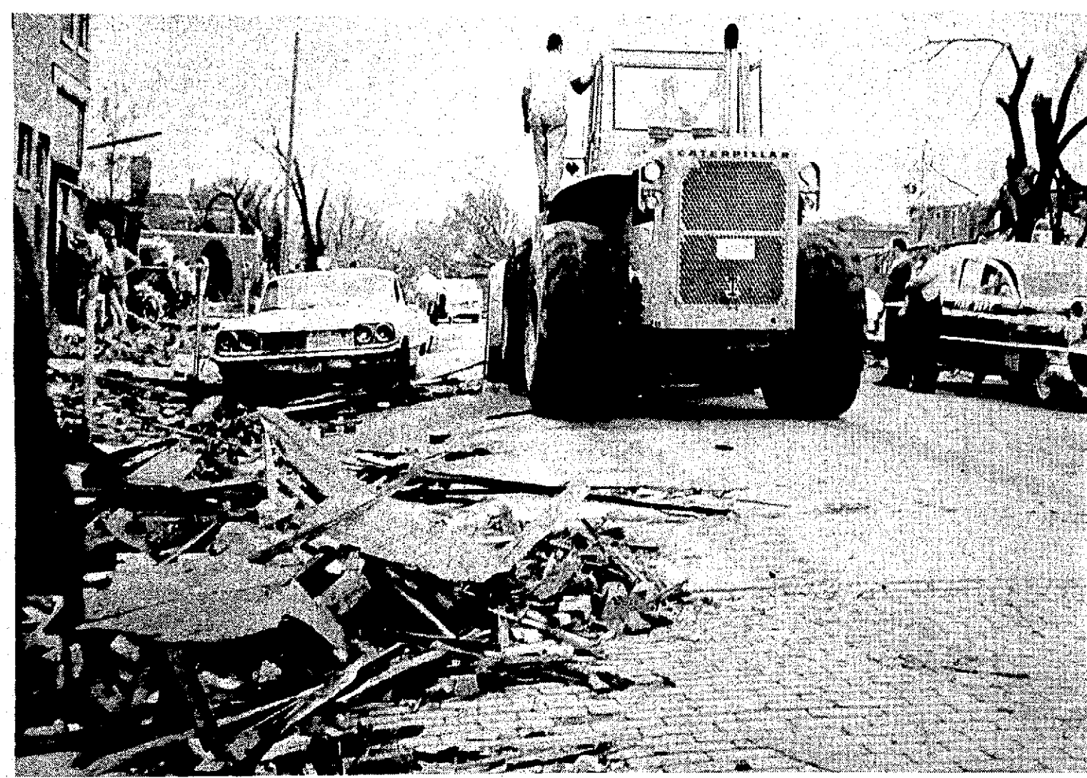
NUMEROUS PIECES of heavy equipment including this giant unit were rushed to the city to assist in the immediate work