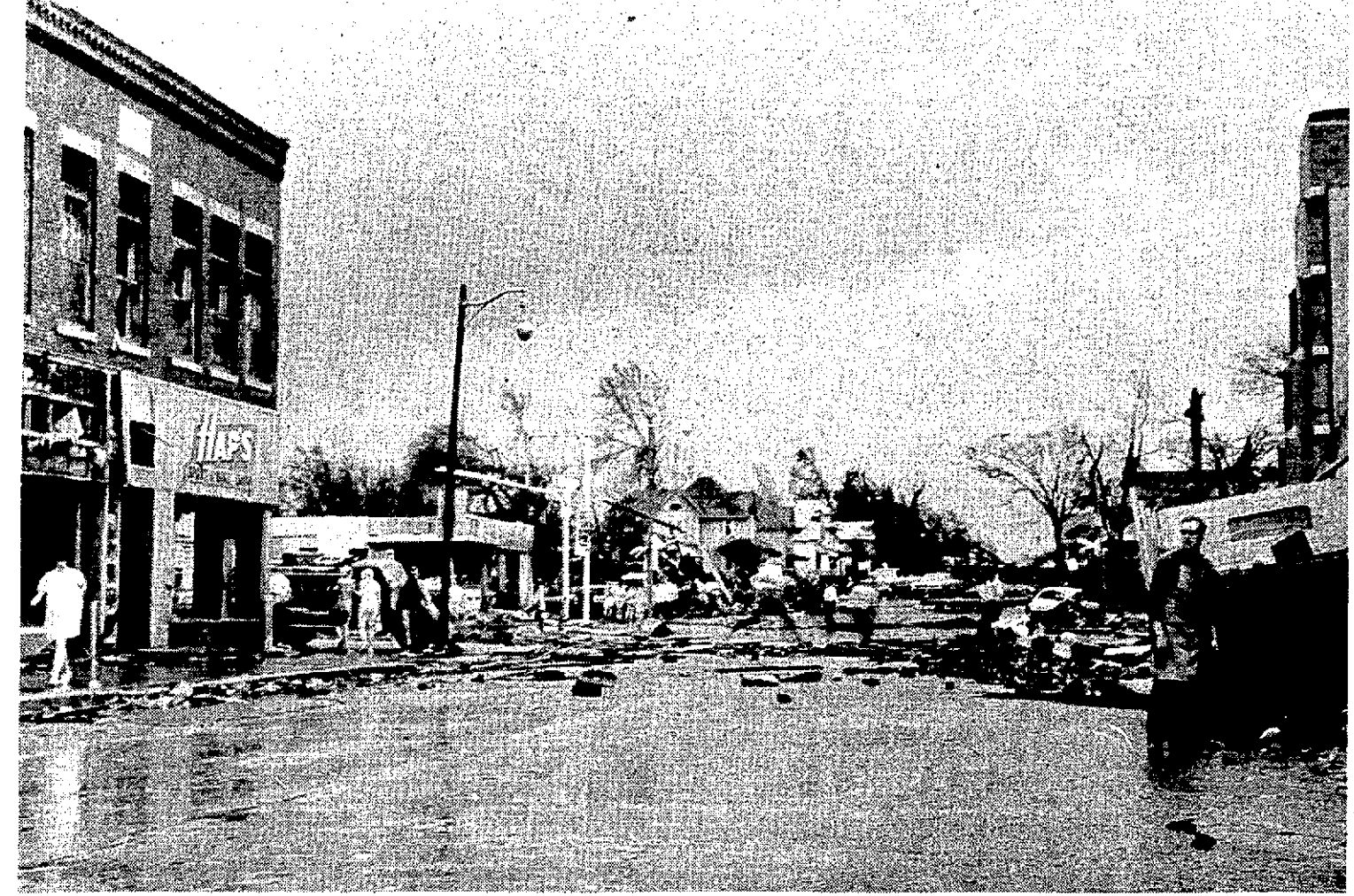
THIS PICTURE was taken immediately following the passing of the storm. It shows a view from the alley east of Frederick Street looking east up Char-