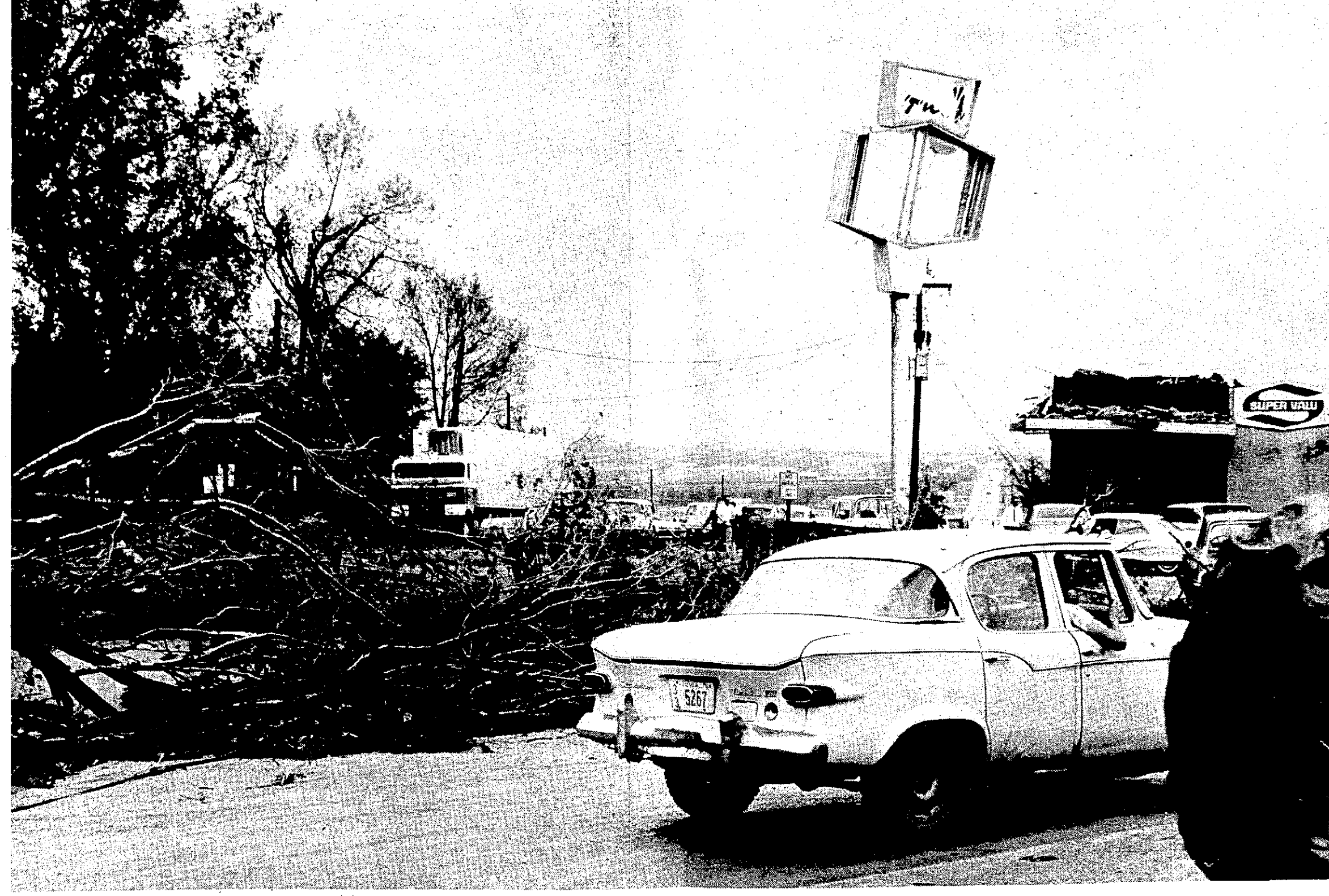
officials halted traffic near the north edge of Oel-wein following the storm Wednesday. The picture shows the damaged area of Fred's Super Valu, downed wires and traffic backed up on highway 150 north of town.

Numerous residents were injured in the violent storm. An exact number was unobtainable at press time today, but REGISTER reporters were continuing their check of conditions and other reports concerning the Maynard area.