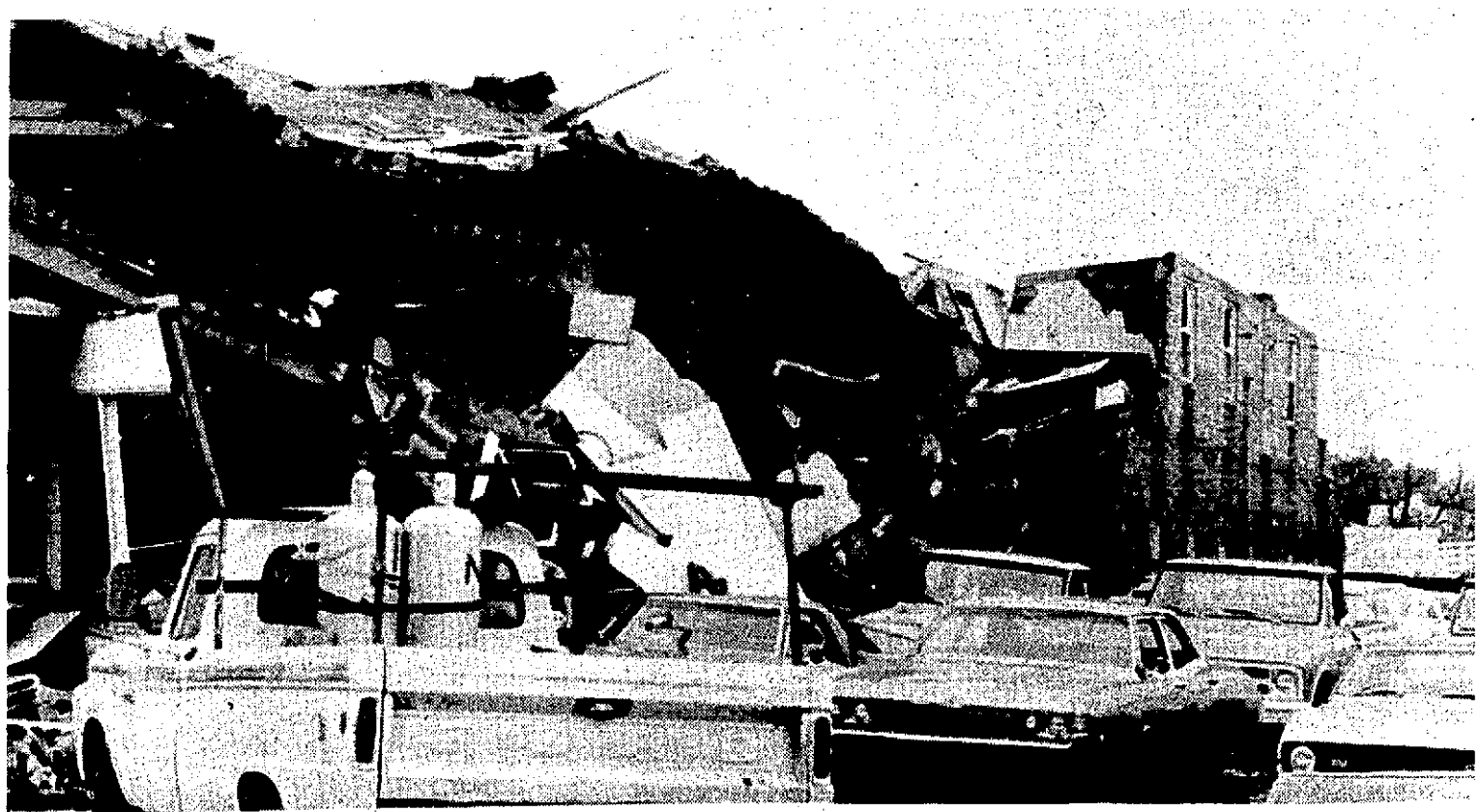
TWISTED ROOFING and wall structure (above) can be seen at the Grand Hotel, just south of Lambert's Chevrolet building on South Freder-