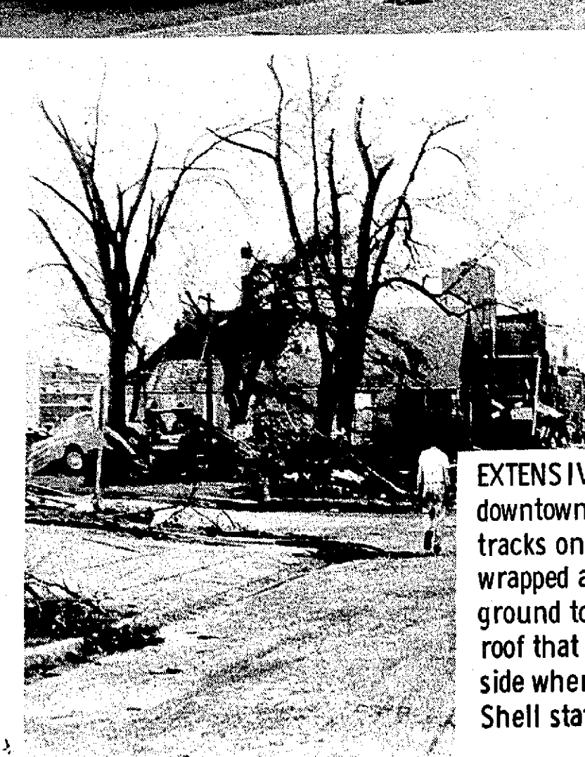
ick. Nearly every building in the downtown section of the city suffered severe roof damage.

EXTENSIVE DAMAGE. The view above looks into downtown Oelwein from just east of the railroad tracks on East Charles. Note the pickup truck wrapped around a tree (at the left). In the background to the left is a section of the Presbyterian roof that was blown off. Also note to the right side where Kuhn's Blacksmith shop and Eldon's Shell station once stood.