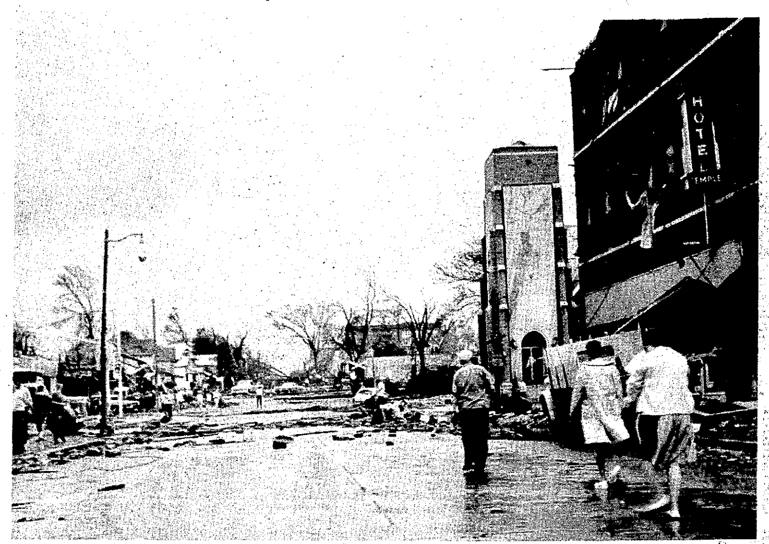
THE TEMPLE HOTEL building (immediate right) suffered extensive damage when the high winds hit the downtown area. Officials later knocked off loose bricks