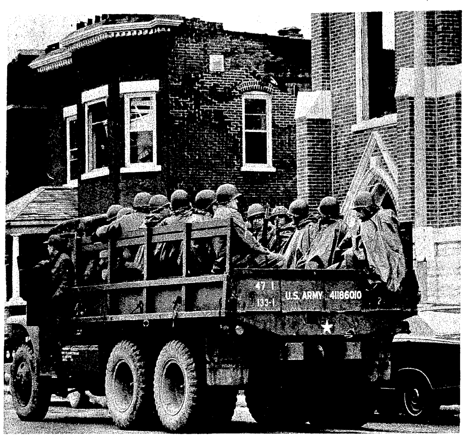
TRUCK LOADS of the Iowa National Guard were called into the city by local and county officials to assist in the problem of traffic and sight-seers. Guardsmen were on duty all night and throughout the day Thursday as clean-up began following Wednesday's storm.